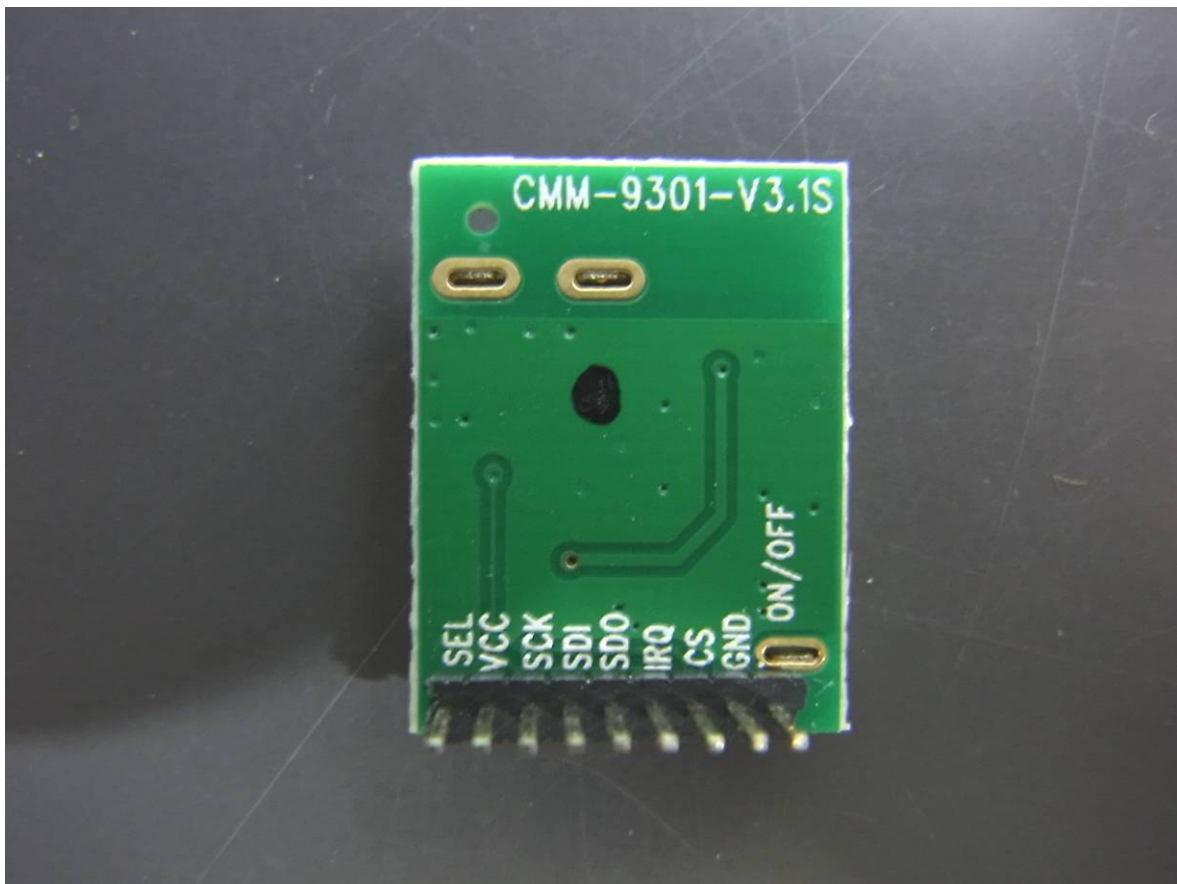
Bottom side (with pin header)