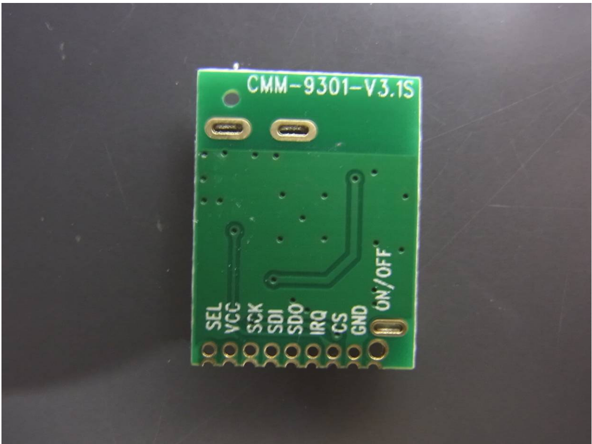
Bottom side (without pin header)