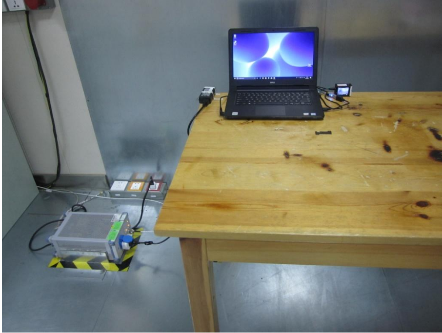
DTS radiation L