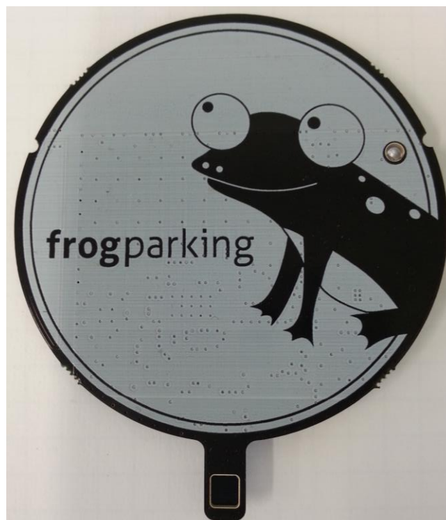
Figure 8 - Frog Main Board (Top side).