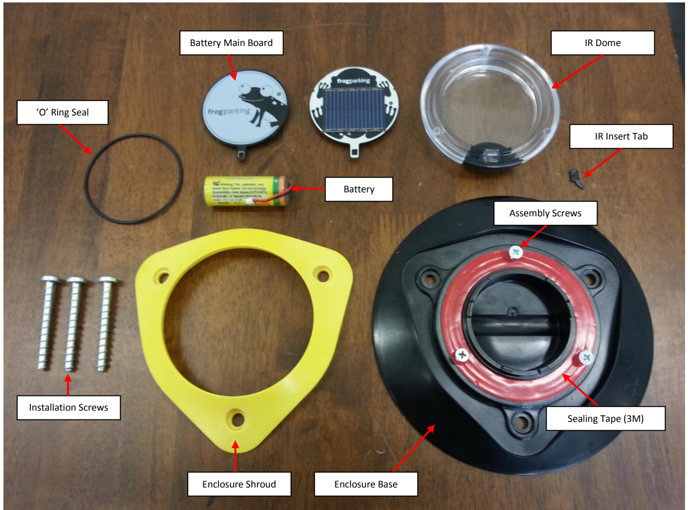
Figure 6 - Frog Sensor Components