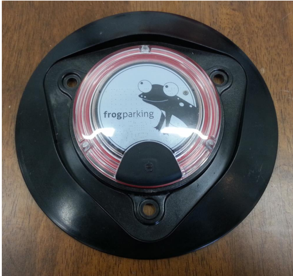
Figure 10 - IR Dome, 'O' Ring Seal and Circuit Board installed in Enclosure Base