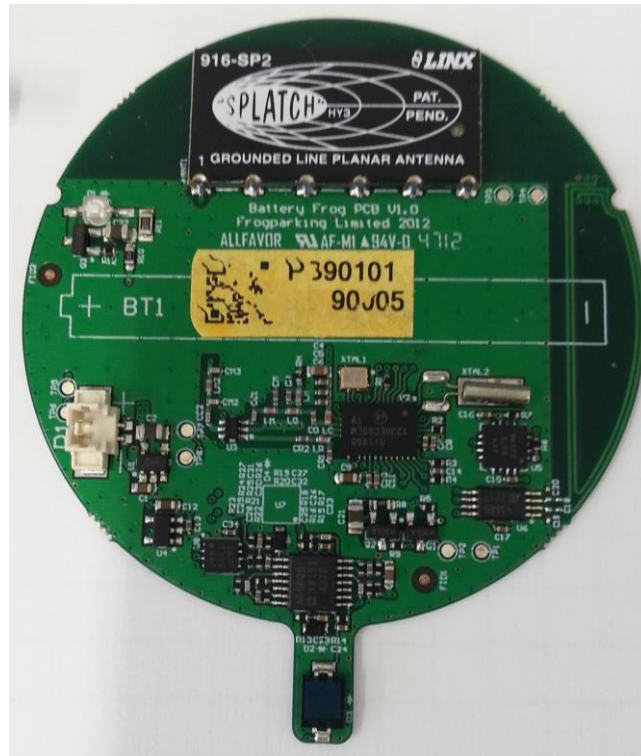
Figure 7 - Frog Main Board (Component side).