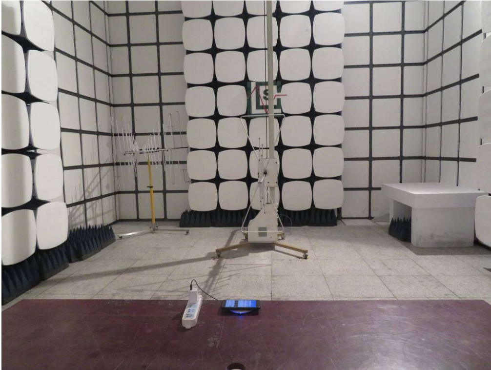
Radiated Emission below 1GHz-AC adapter charge mode