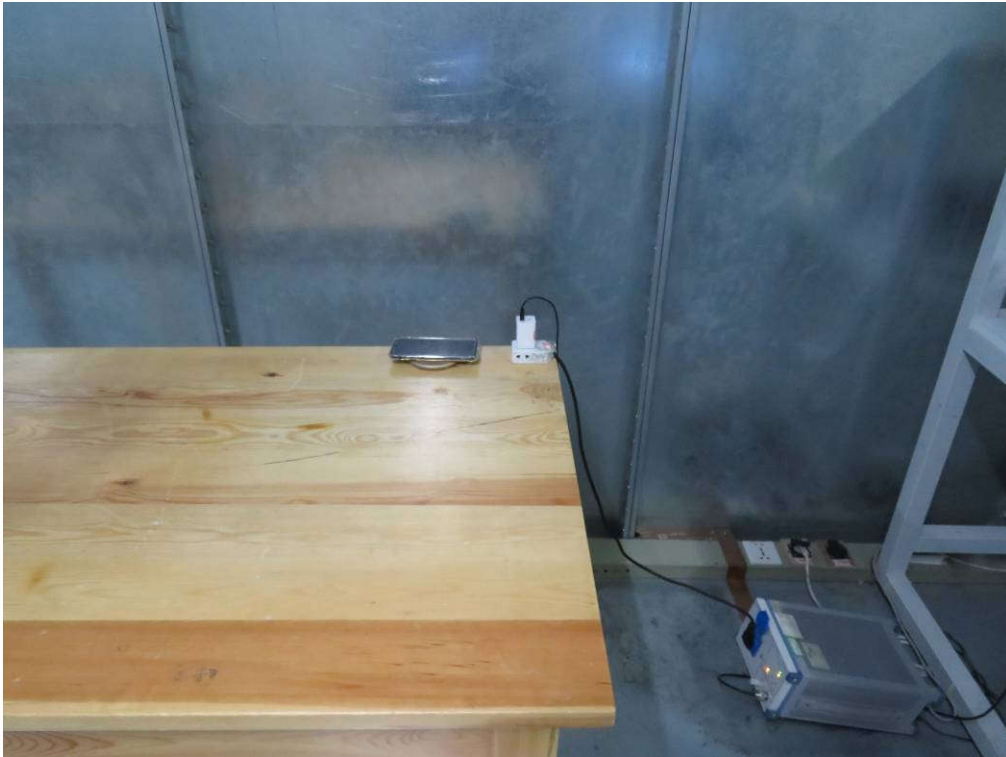
Conducted Emission-AC adapter charge mode