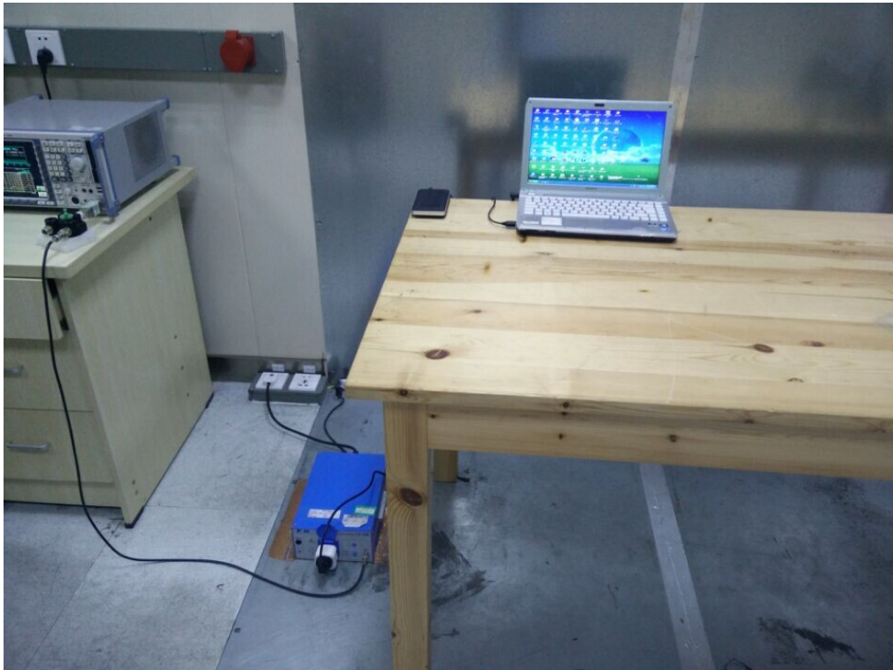
Radiated Spurious Emissions From 30MHz-1000MHz