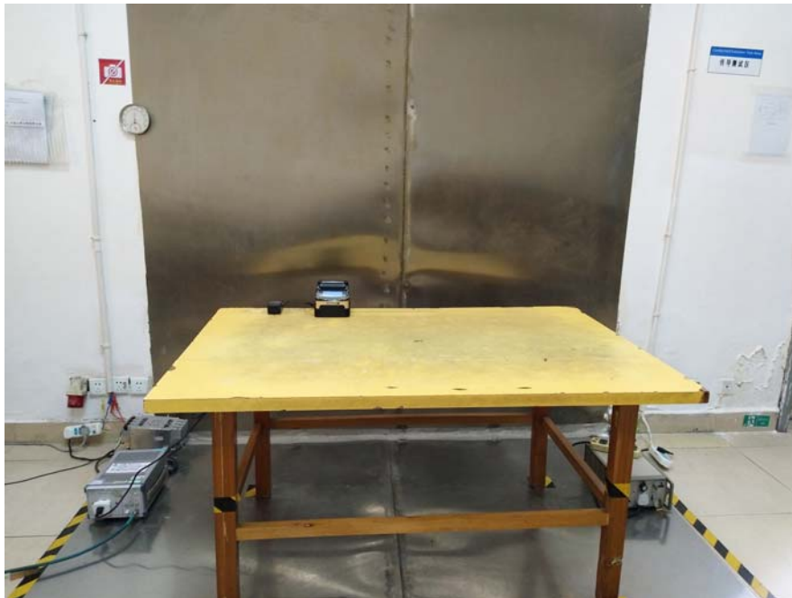
Conducted Emission Side View