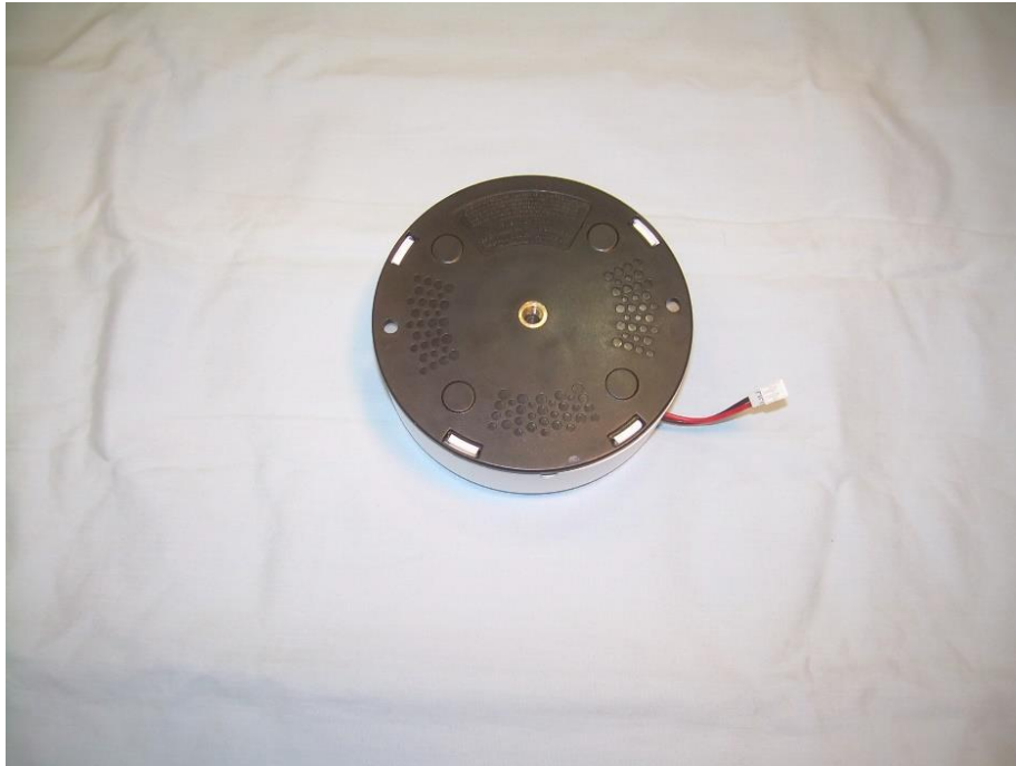
Photograph 3 – Back View of the EUT