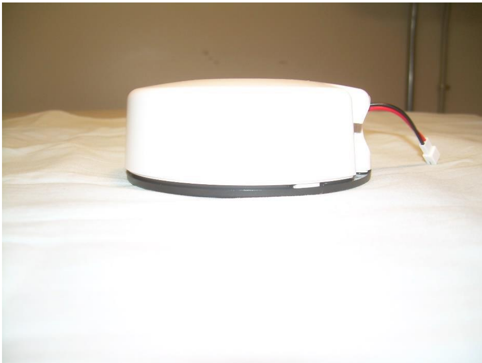
Photograph 2 – Side 1 View