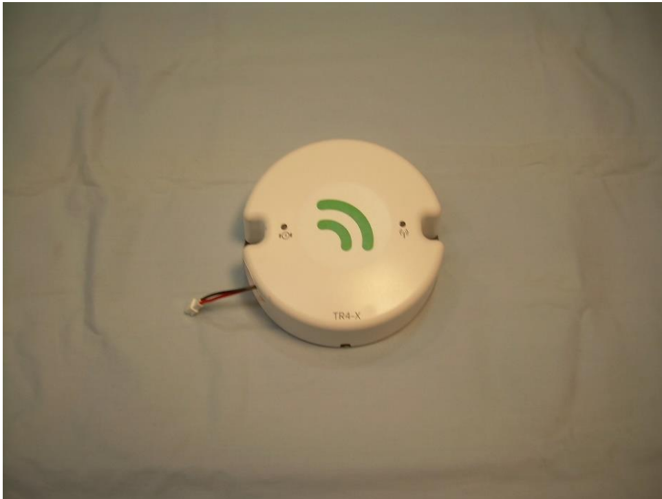
Photograph 1 – Front View of the EUT