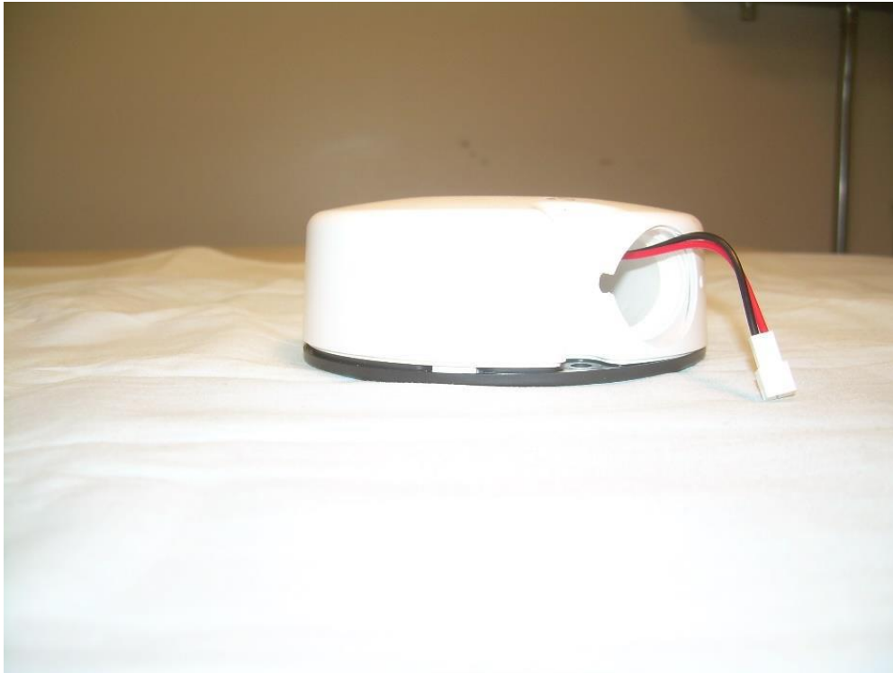
Photograph 5 – Side 3 View