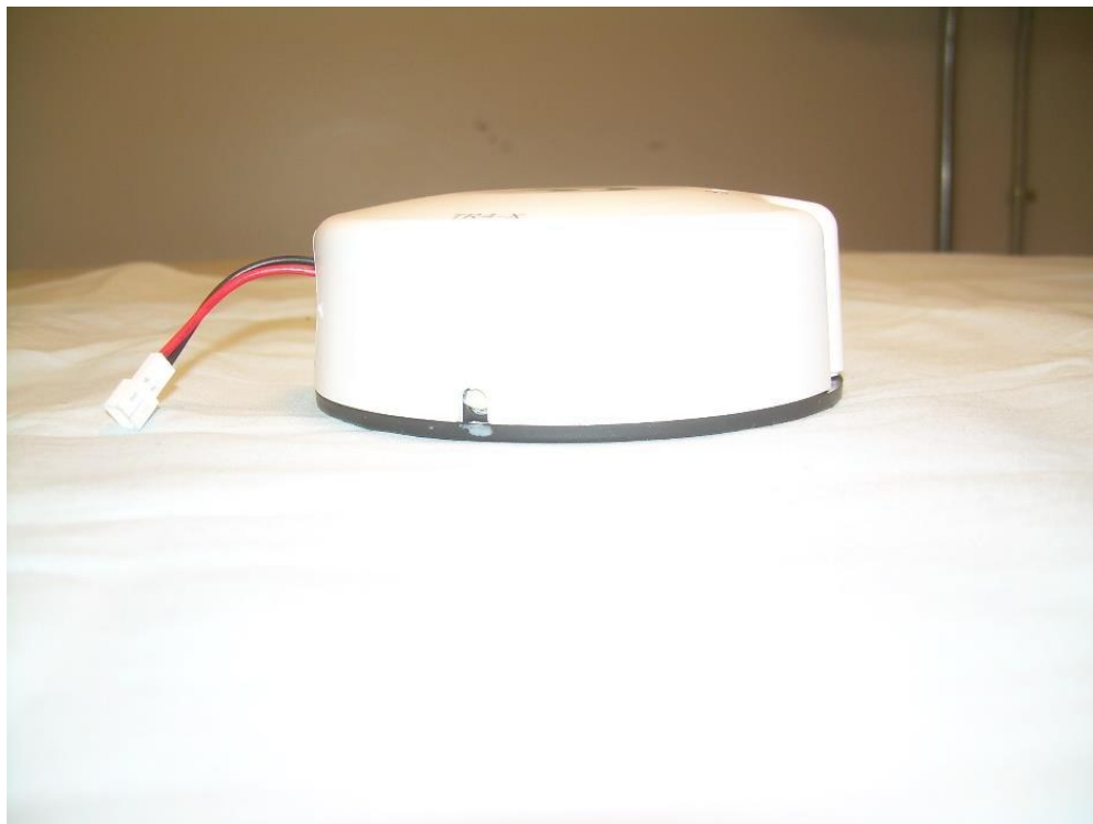
Photograph 6 – Side 4 View