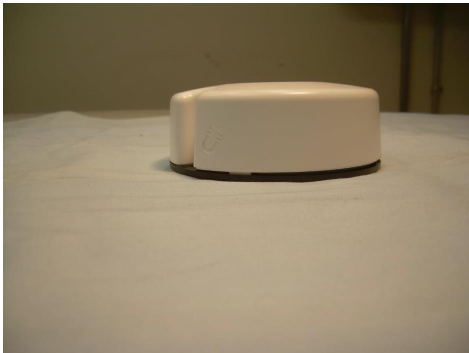
Photograph 4 – Side 2 View