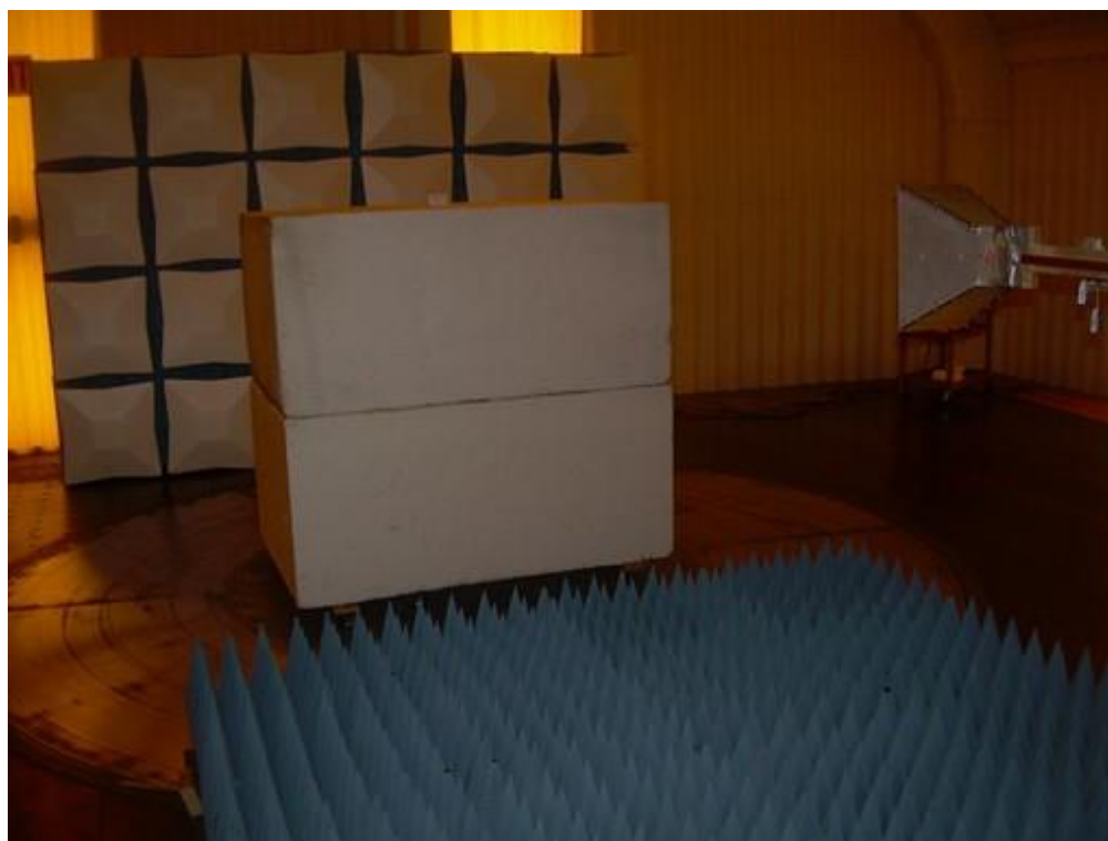
Photograph 3: Front View Radiated Emissions Worst Case – Above 1000 MHz Configuration