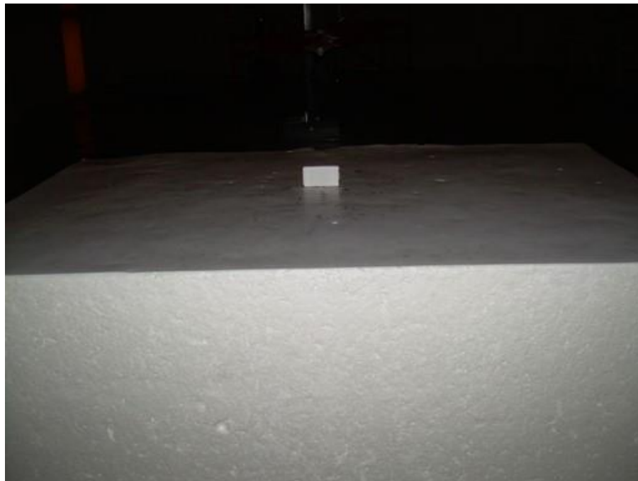
Photograph 2: Back View Radiated Emissions, Below 1000 MHz Worst Case Configuration