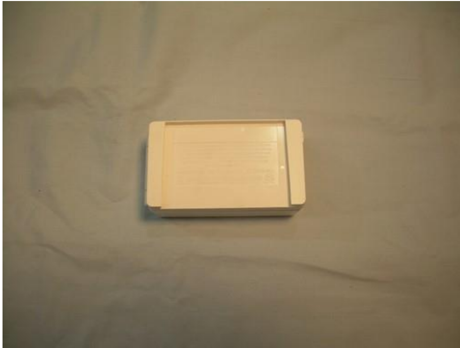
Photograph 3 – Back View of the EUT