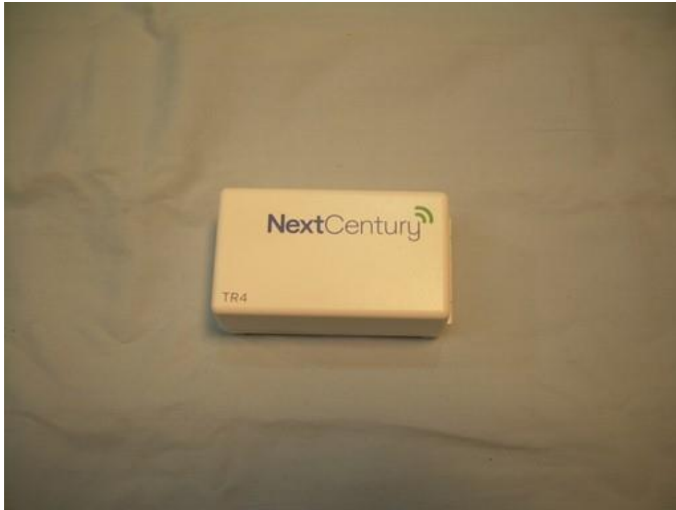
Photograph 1 – Front View of the EUT