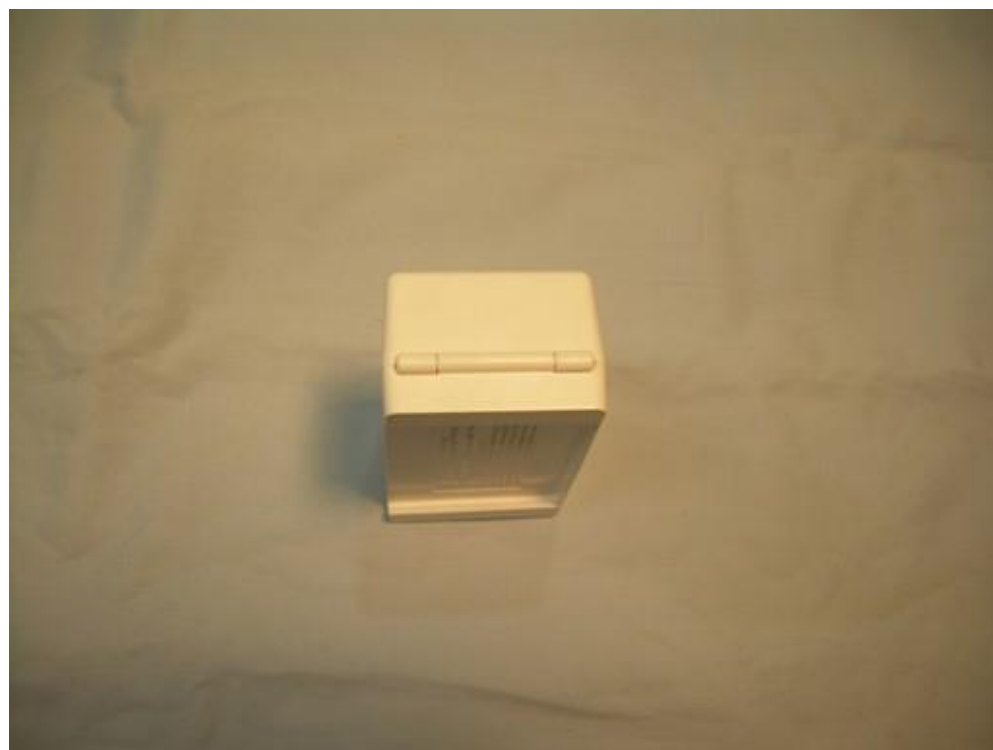
Photograph 6 – Side 4 View