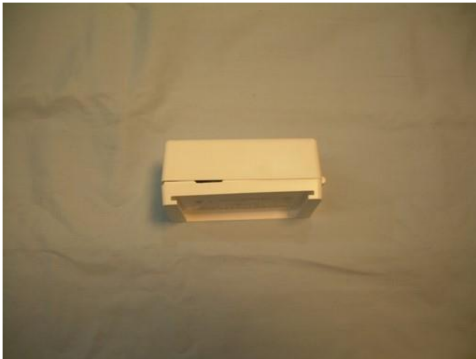
Photograph 4 – Side 2 View