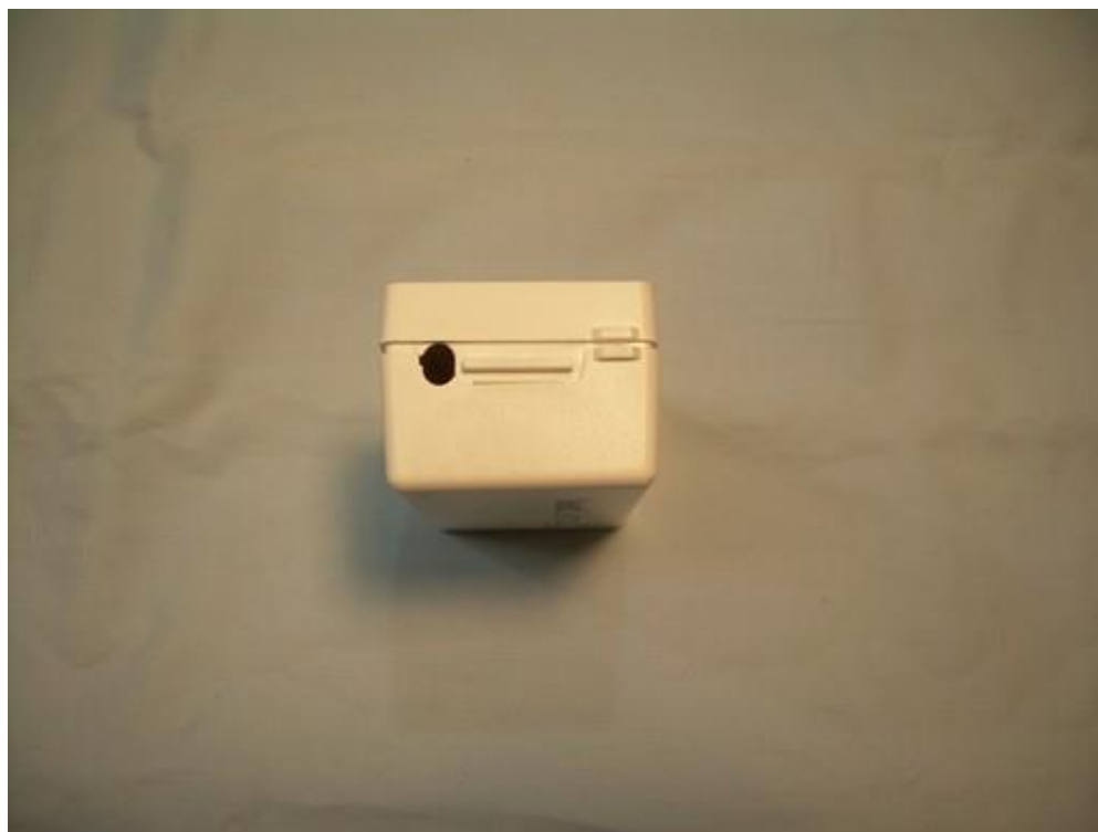
Photograph 5 – Side 3 View