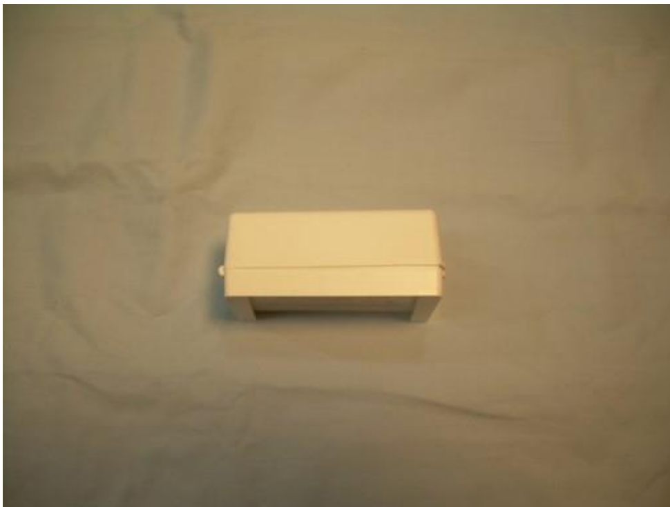
Photograph 2 – Side 1 View