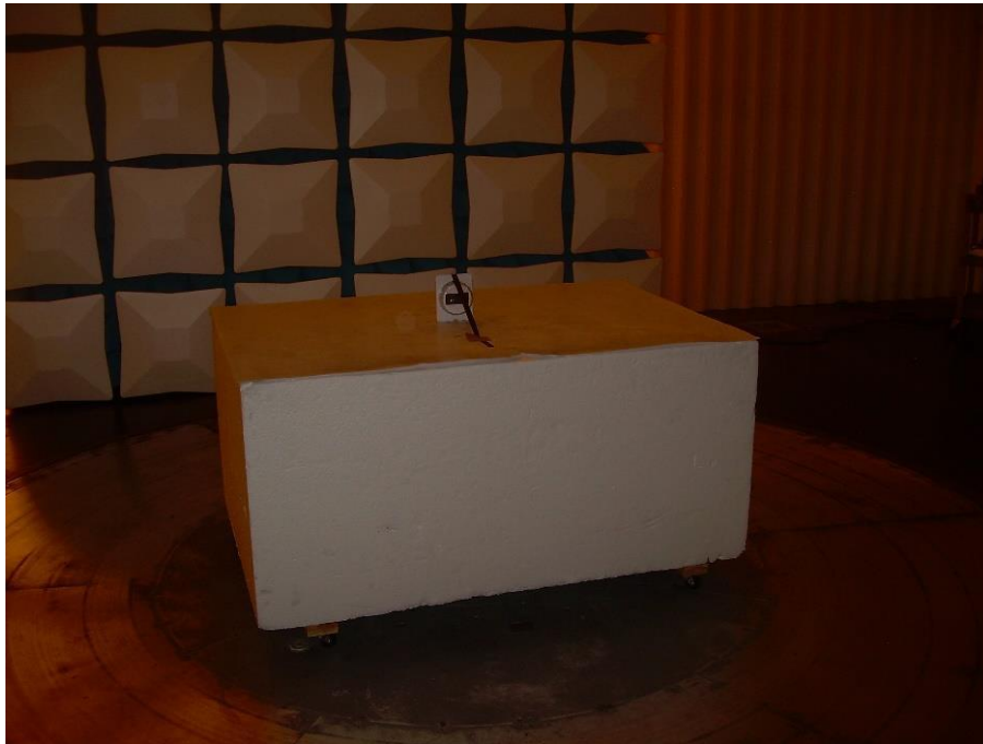
Photograph 1: Front View Radiated Emissions, Below 1000 MHz Worst Case Configuration