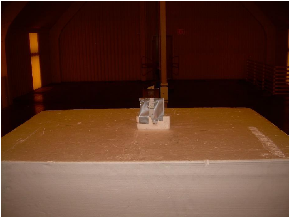
Photograph 44: Back View Radiated Emissions Worst Case – Above 1000 MHz Configuration