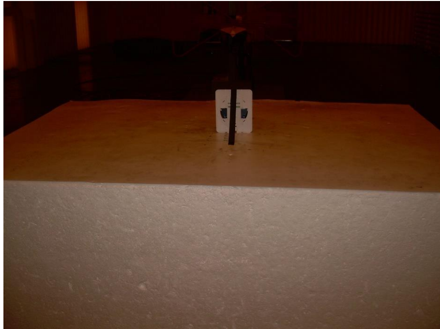
Photograph 2: Back View Radiated Emissions, Below 1000 MHz Worst Case Configuration