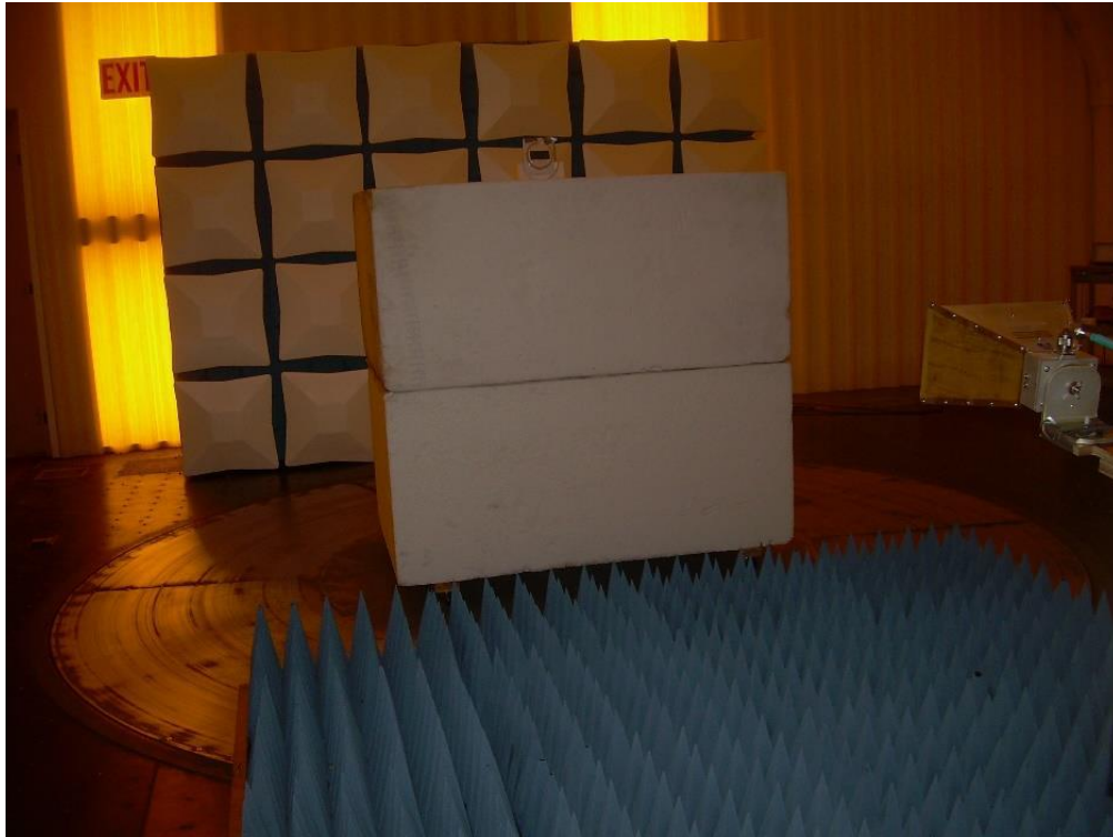
Photograph 3: Front View Radiated Emissions Worst Case – Above 1000 MHz Configuration