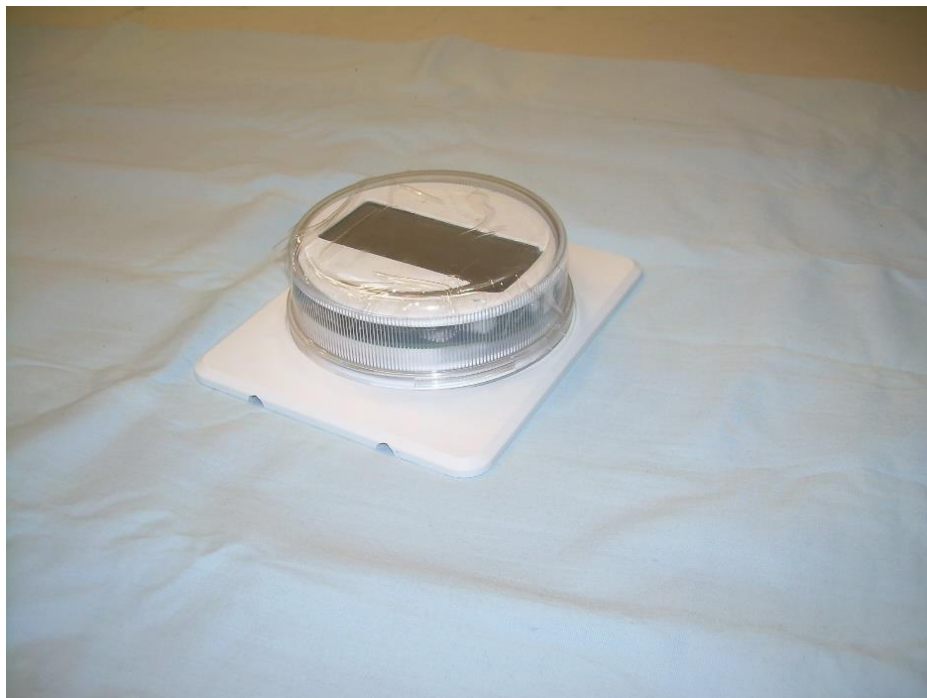
Photograph 4 – Side 2 View