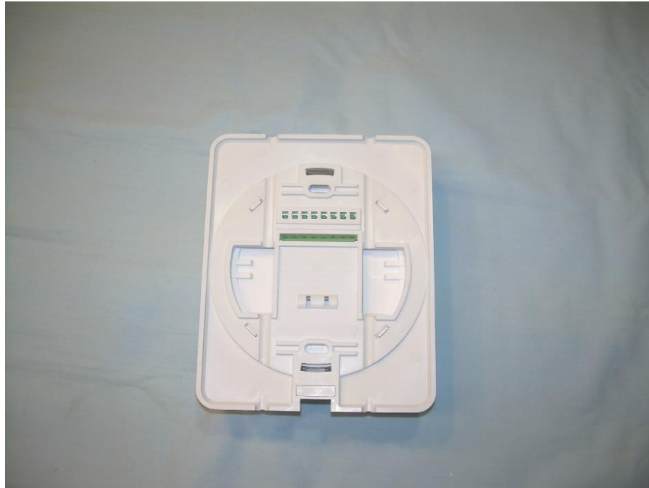
Photograph 3 – Back View of the EUT