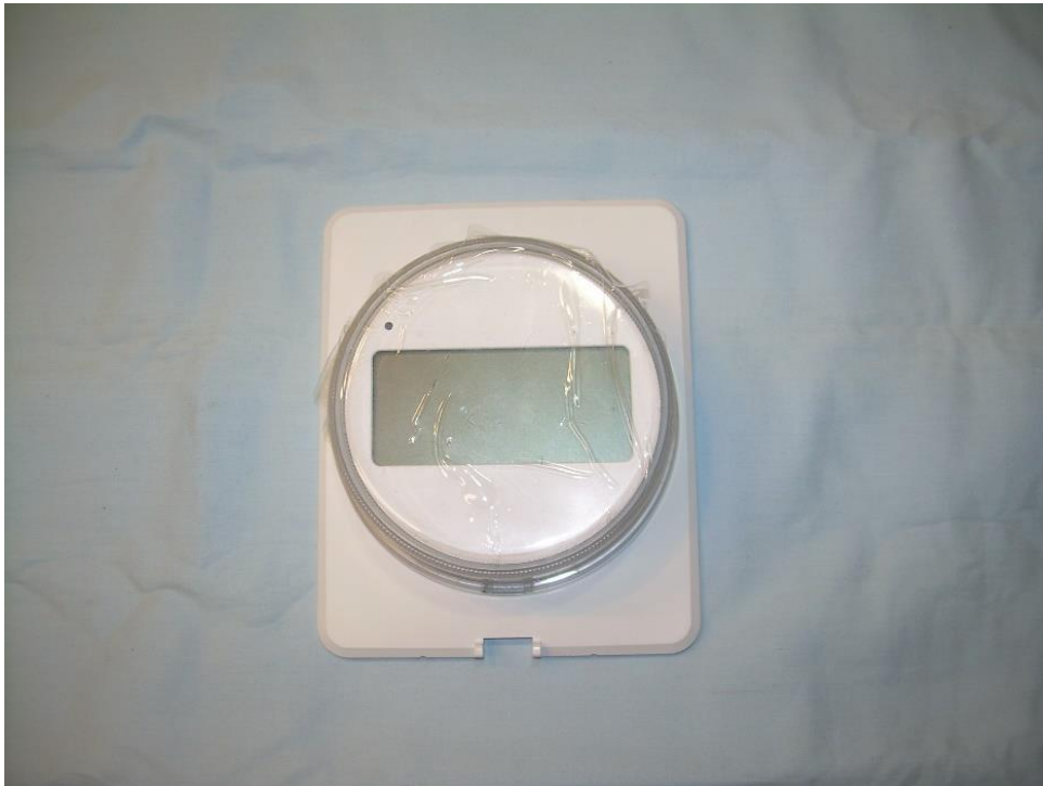
Photograph 1 – Front View of the EUT