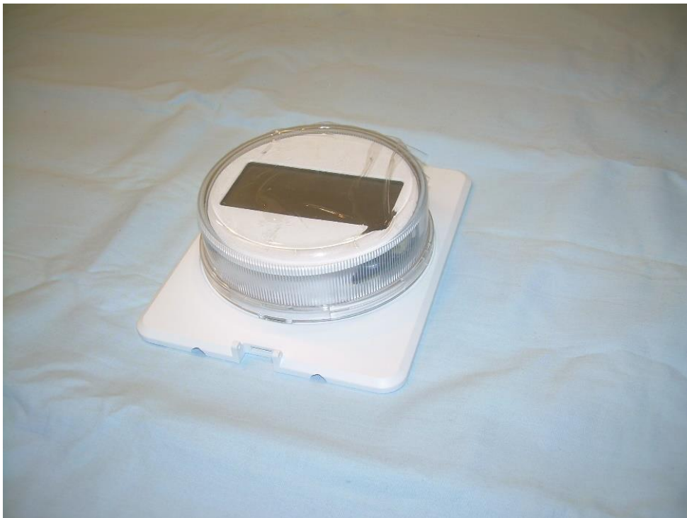
Photograph 2 – Side 1 View