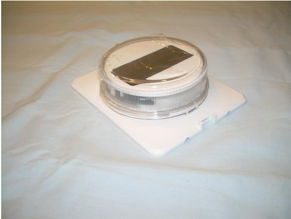
Photograph 5 – Side 3 View