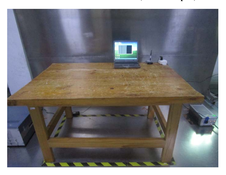
Conducted\ Emissions-Side\ View(AC/DC\ Adapter)

Conducted Emissions– Front View(AC/DC Adapter)