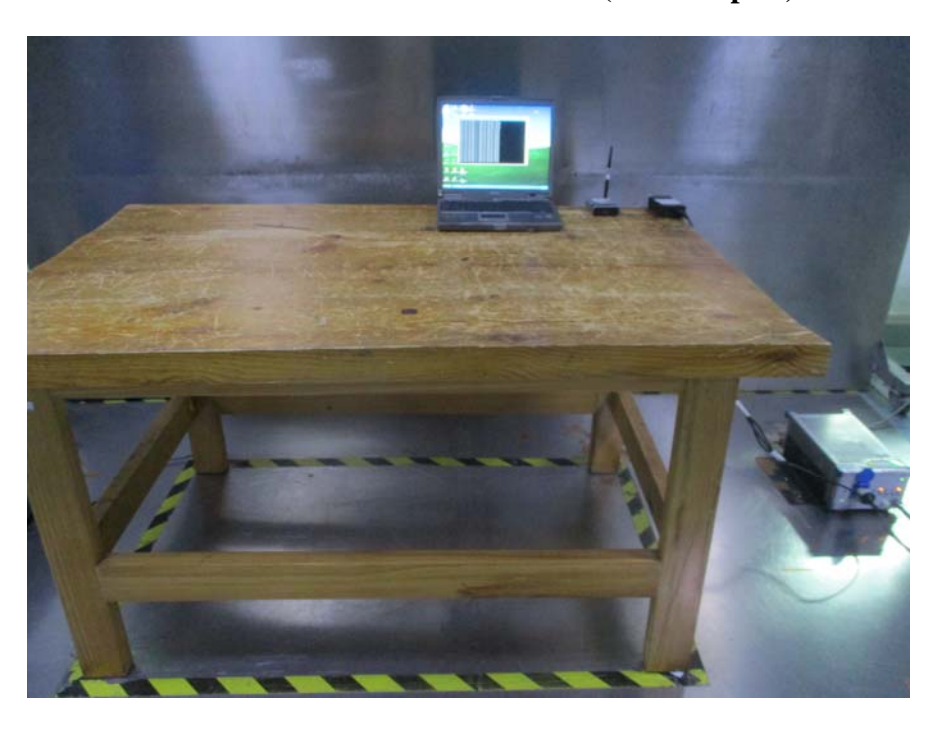
Conducted\ Emissions-Side\ View (PoE\ Adapter)