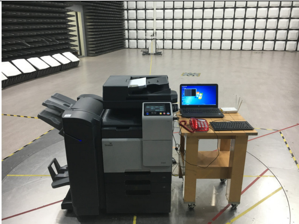
EUT 1_Test Setup for 30 MHz ~ 1 000 MHz