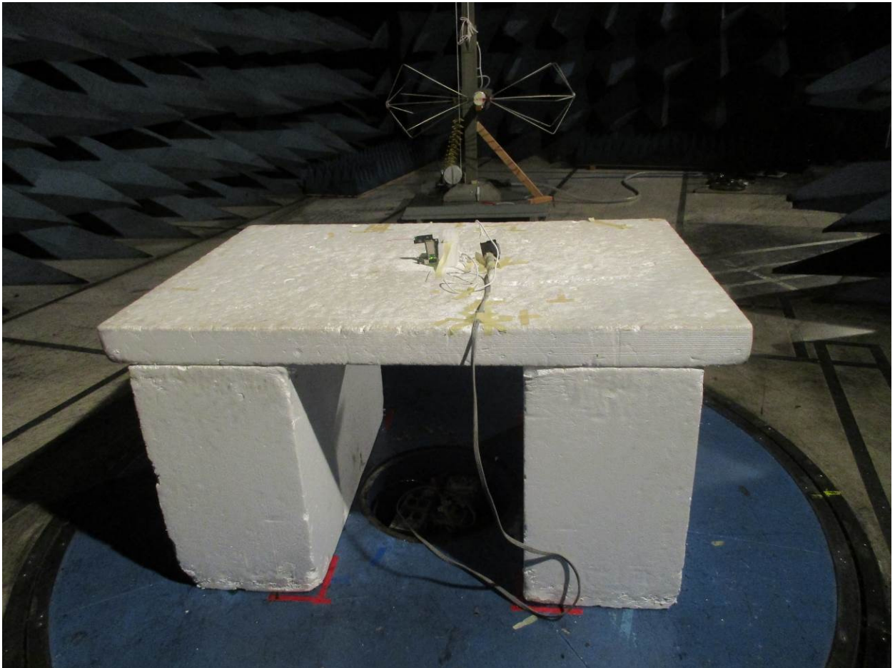
Figure 3: Radiated Emissions – Back View – 30 MHz – 200 MHz