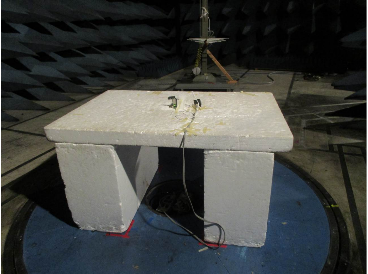
Figure 4: Radiated Emissions – Back View – 200 MHz – 1 GHz