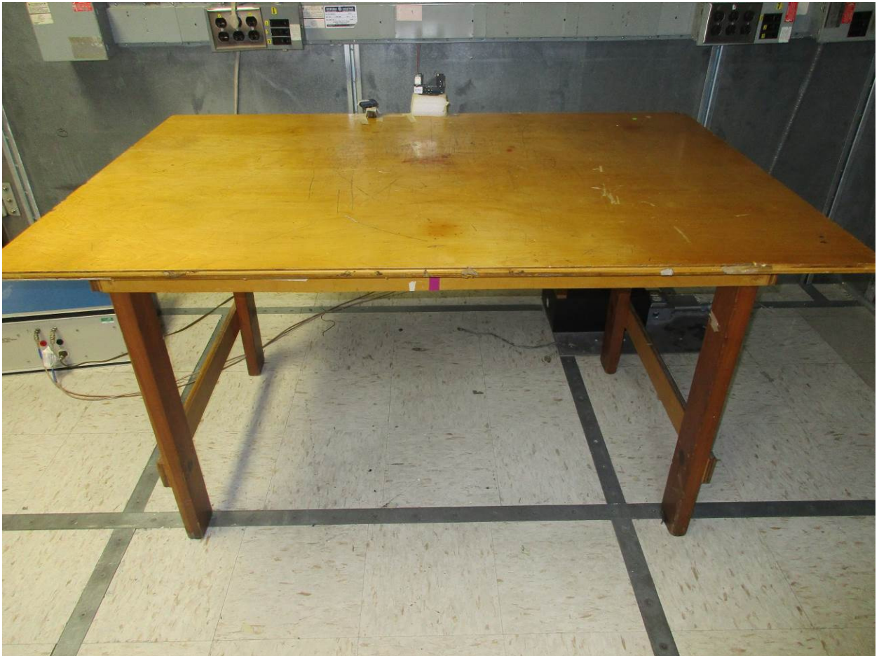
Figure 8: Power Line Conducted Emissions – Front View