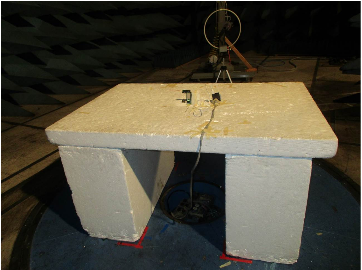
Figure 2: Radiated Emissions – Back View – 9 kHz – 30 MHz