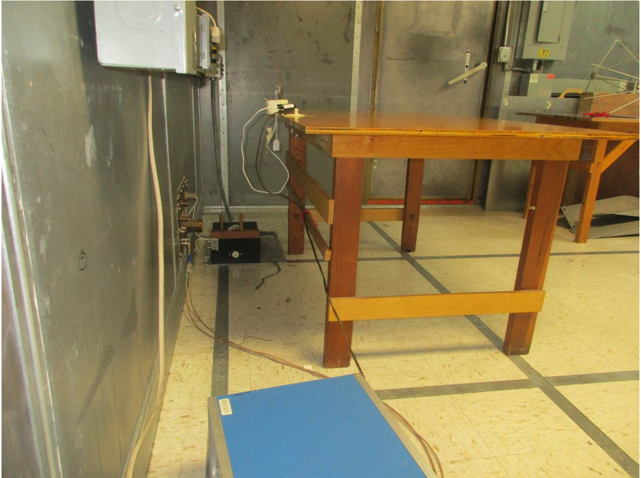
Figure 9: Power Line Conducted Emissions – Side View