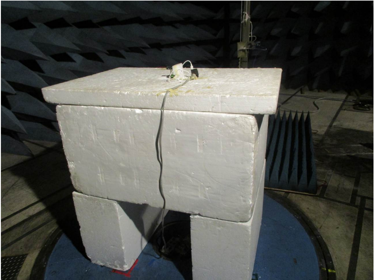
Figure 6: Radiated Emissions – Back View – Above 1 GHz