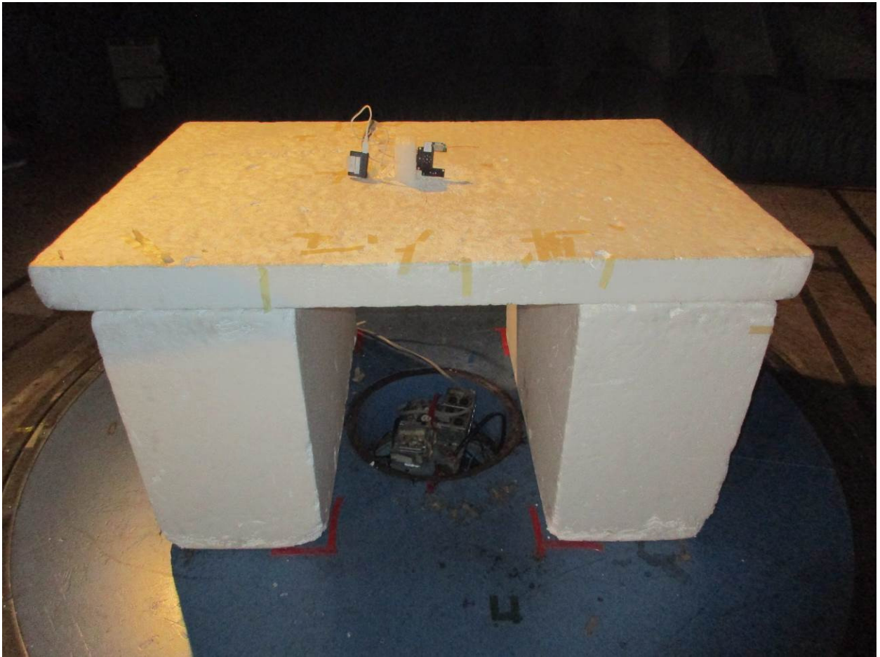
Figure 1: Radiated Emissions – Front View – Below 1 GHz