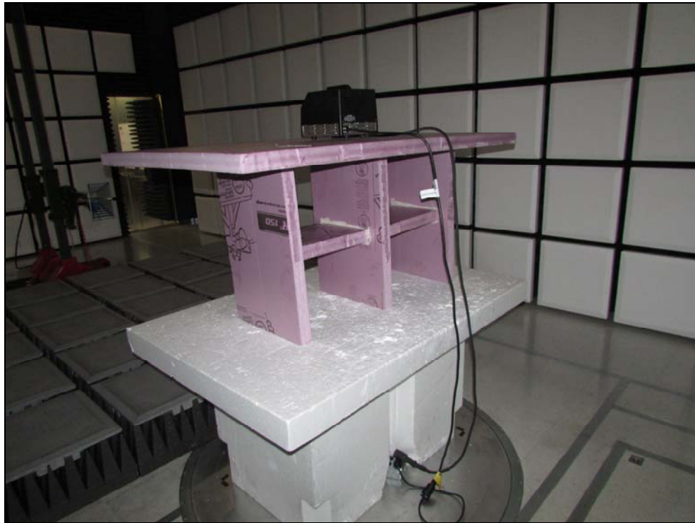
Figure 1: 48VDC Host - Back