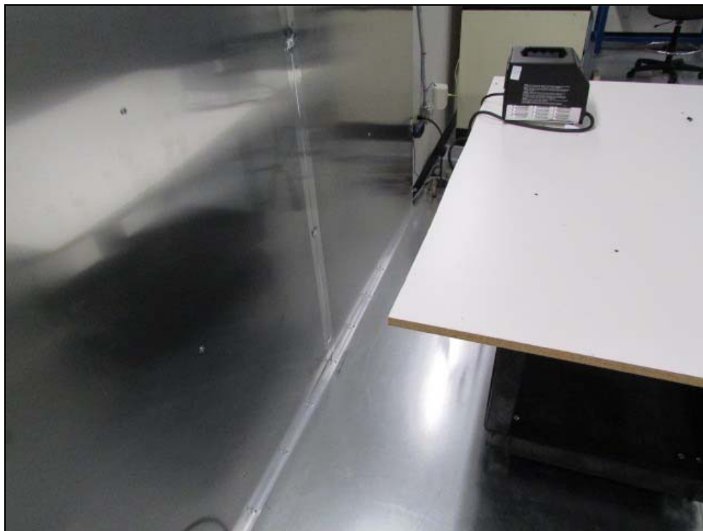
Figure 4: Power Line Conducted – Side View