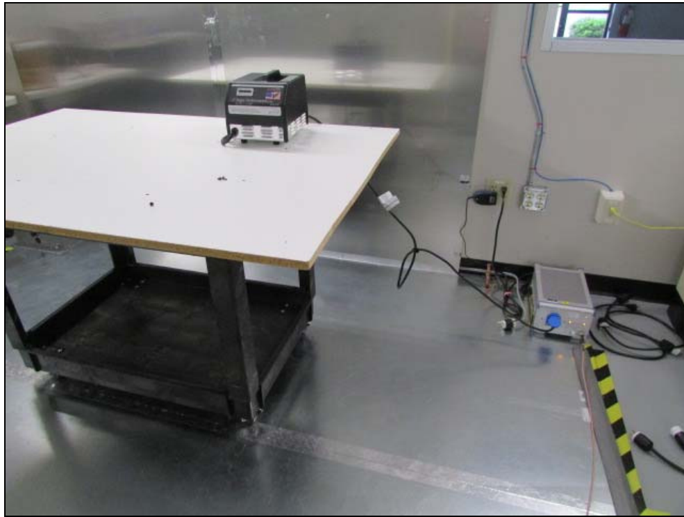
Figure 3: Power Line Conducted – Front View