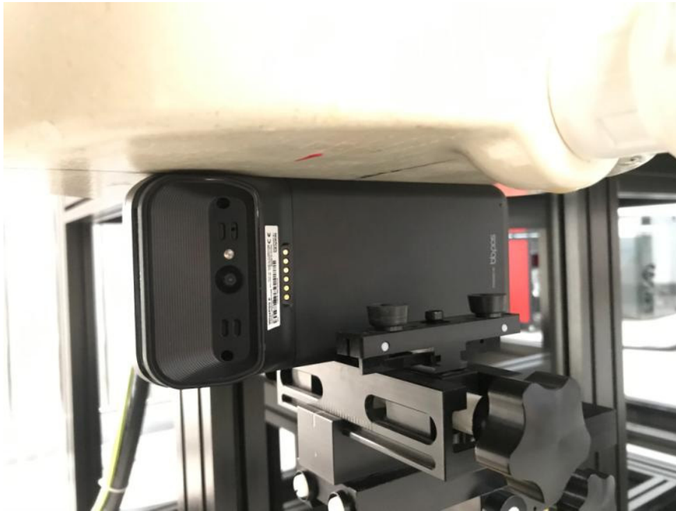
Handheld Top Setup Photo(0mm)