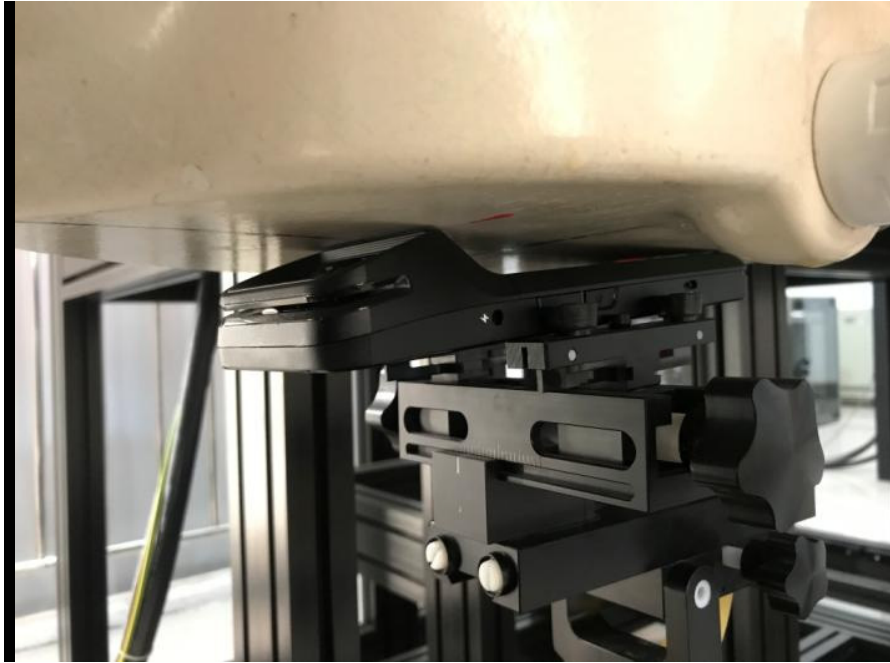
Handheld Right Setup Photo(0mm)