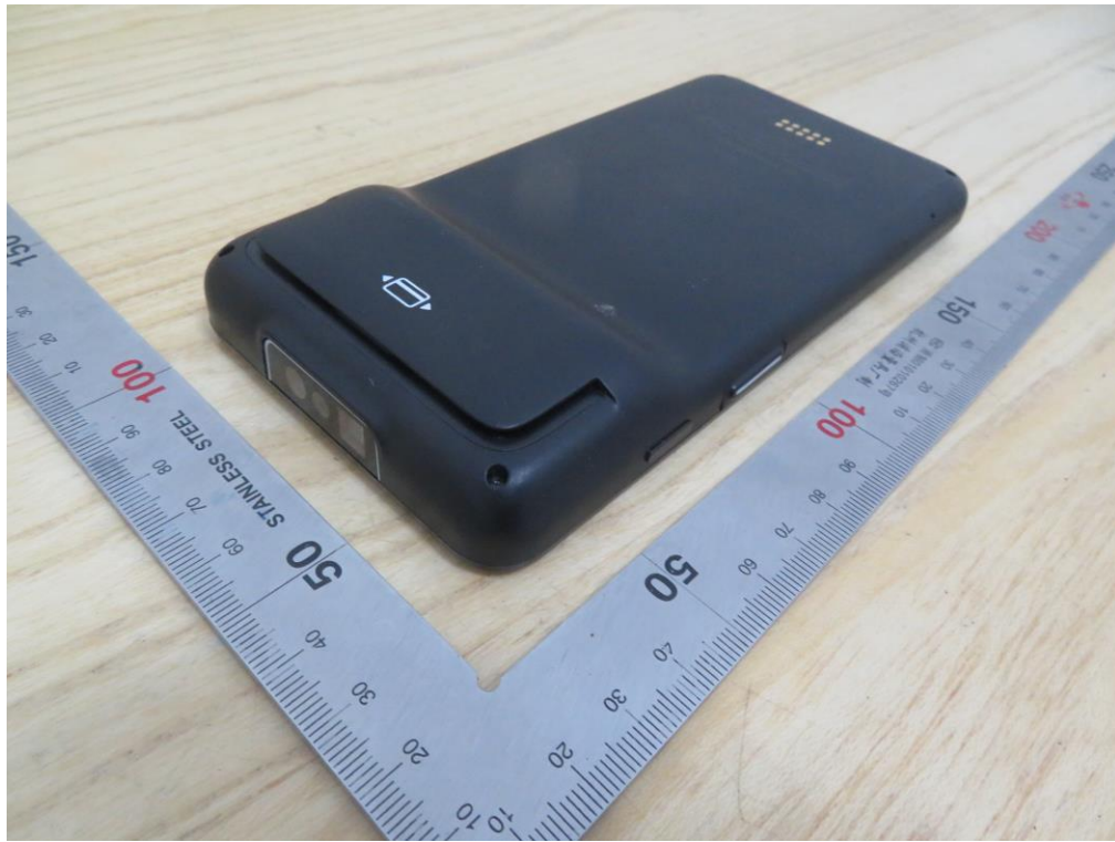
View of EUT-4