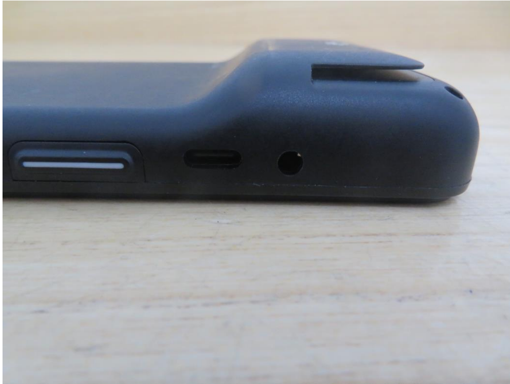
View of EUT-6