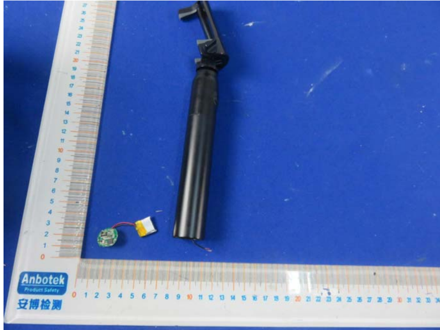
The EUT-Inside View