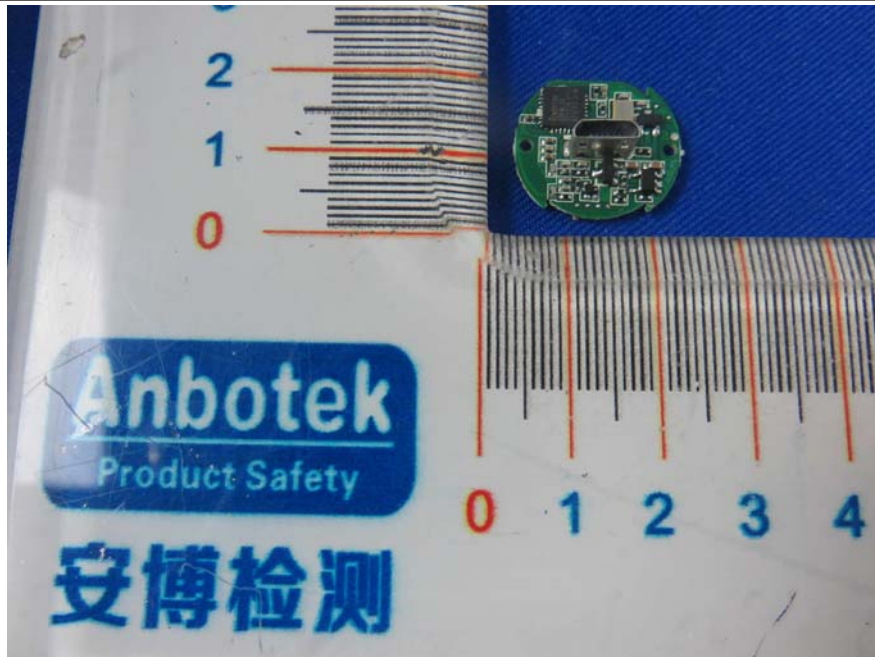
PCB of the EUT-Front View