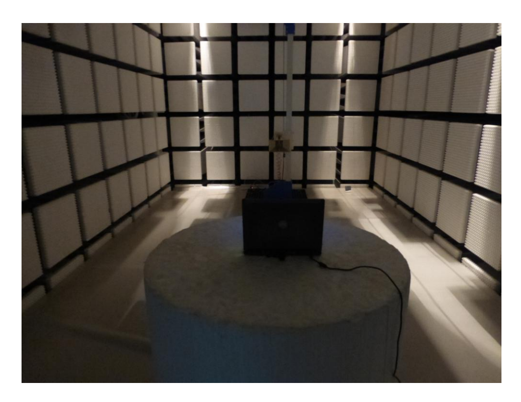
Radiated Emission Above 1GHz