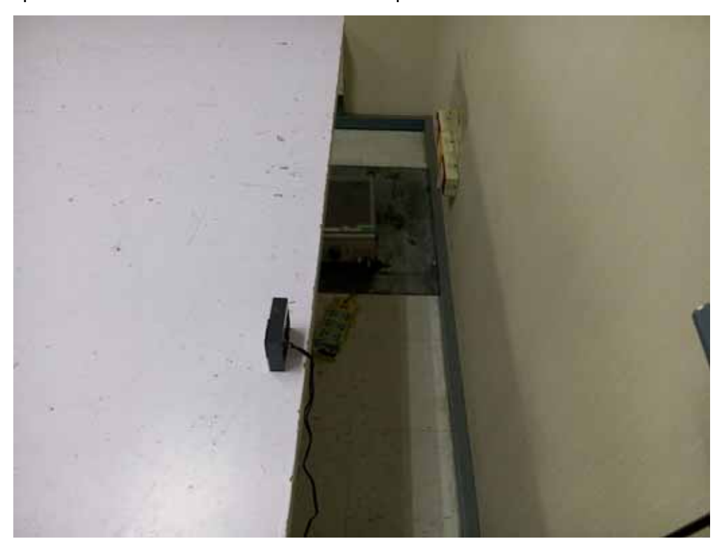
Description : Back View of Conducted Test Setup

Description: Front View of Conducted Test Setup