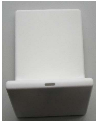
Figure 1: Installed Hygiene Sensor

This is a wall-mounted device that is placed under existing hygiene dispensers throughout the facility. When activated this device measures signal strength of badges located near it and transmits the information to the nearest Location Hub for processing. A picture of an installed Hygiene Sensor is provided in Figure 1.