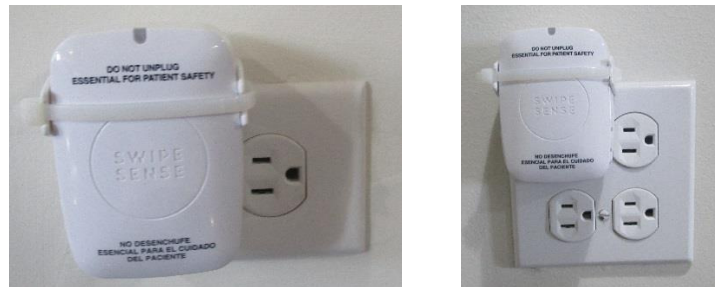
Figure 1: Installed Location Hub

This is a wall-mounted device that is placed inside each of the patient areas and non-patient areas. This device measures signal strength of badges located near it and transmits the information to the communication hub for processing. A picture of an installed Location Hub is provided in Figure 1.