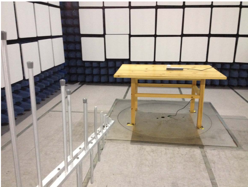
30MHz to 1GHz