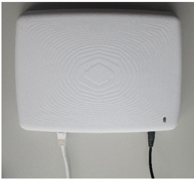
Figure 1: Installed Communication Hub

This is a wall-mounted device that is placed at a nurse's station. This device receives information from the Location Hubs, Hygiene Sensors, Entry Sensors, and Badges. It also transmits software updates to the Location Hubs, Hygiene Sensors, Entry Sensors, and Badges as necessary. A picture of an installed Communication Hub is provided in Figure 1.