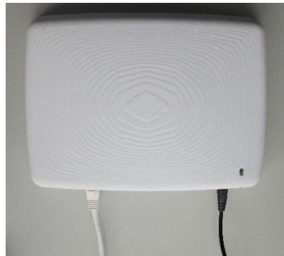
Figure 1: Installed Communication Hub

This is a wall-mounted device that is placed at a nurse's station. This device receives information from the Location Hubs, Hygiene Sensors and Badges. It also transmits software updates to the Location Hubs, Hygiene Sensors and Badges as necessary. A picture of an installed Communication Hub is provided in Figure 1.