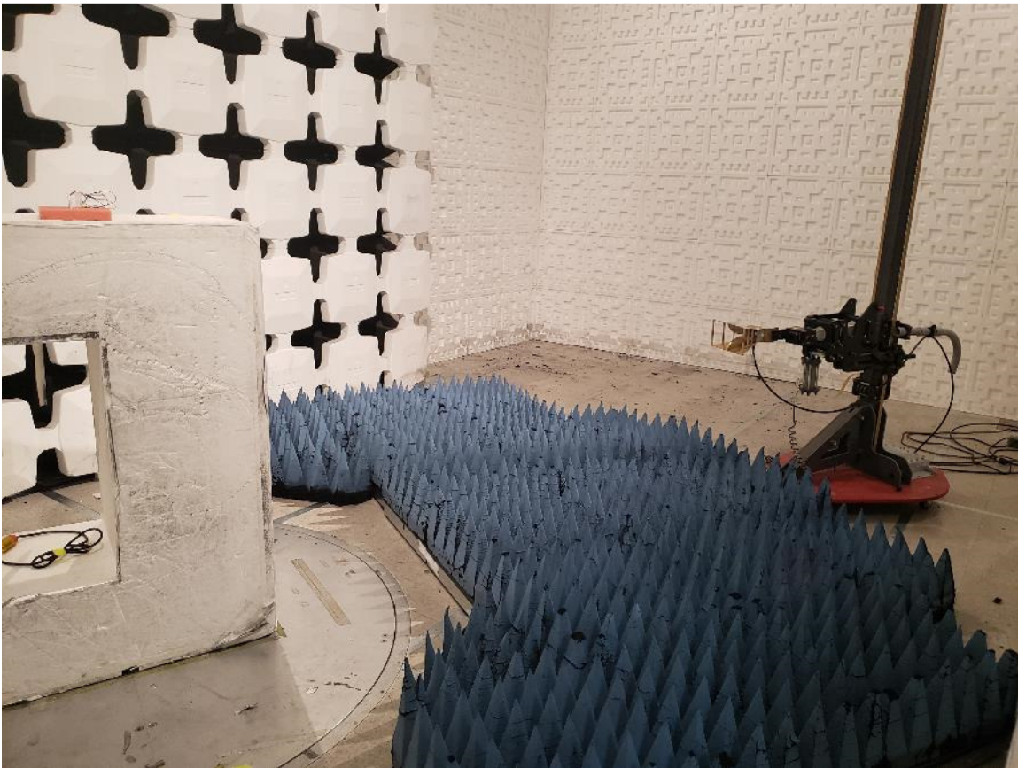
Figure 5. Radiated Emission Test Setup, above 1 GHz

FCC Part 15 Certification 2AB5RBAD221 23-0091 June 21, 2023 SwipeSense, Inc. Asset Tag