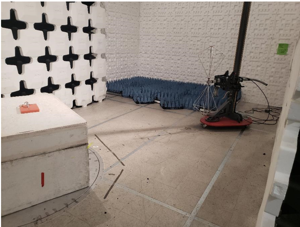
Figure 3. Radiated Emissions Test Setup, 30 MHz to 200 MHz

FCC Part 15 Certification 2AB5RBAD221 23-0091 June 21, 2023 SwipeSense, Inc. Asset Tag