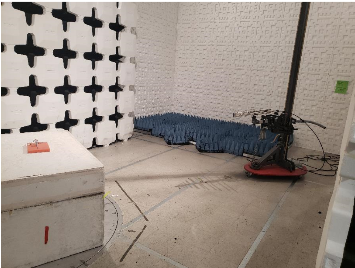
Figure 4. Radiated Emissions Test Setup, 200 MHz to 1GHz

FCC Part 15 Certification 2AB5RBAD221 23-0091 June 21, 2023 SwipeSense, Inc. Asset Tag