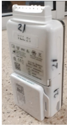
Figure 1: Asset Tag

This is a small device that should be attached to any asset that needs to be tracked. This device transmits signals to the Location Hubs allowing them to establish their location. A picture of the SwipeSense Asset Tag attached to a Phillips Intellivue MX40 as an example is provided in Figure 1.