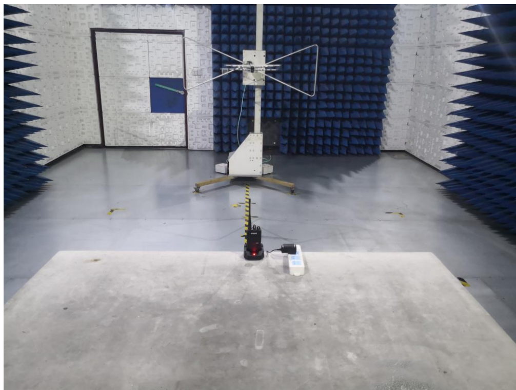
RADIATED EMISSION TEST SETUP ABOVE 1GHz