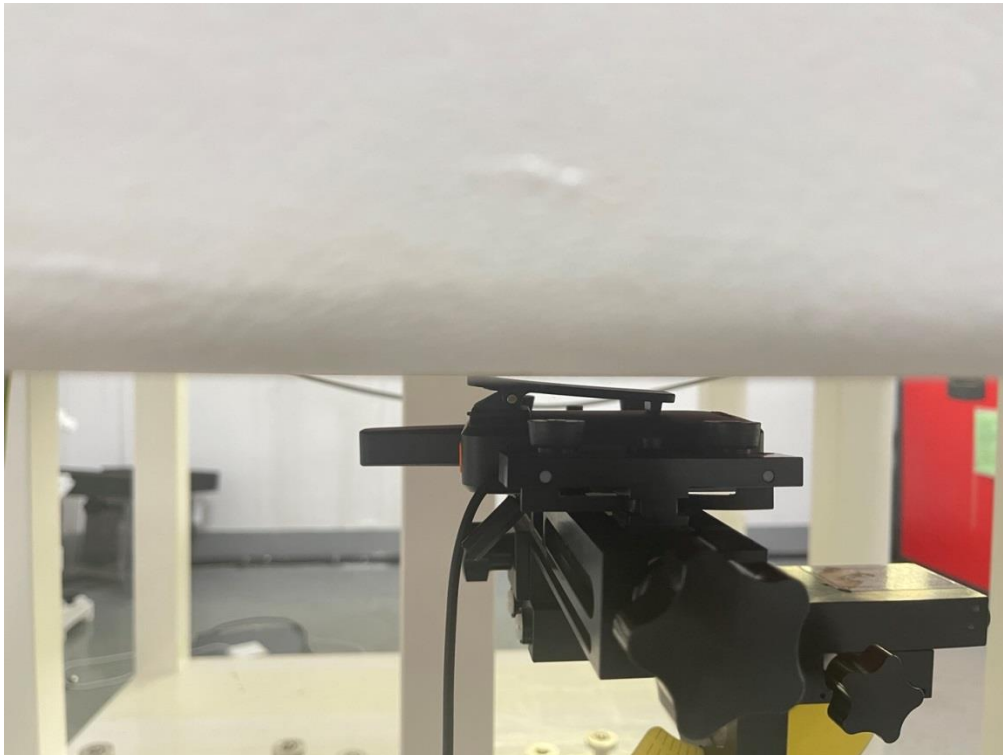
The thickness of EUT is 2.3 cm