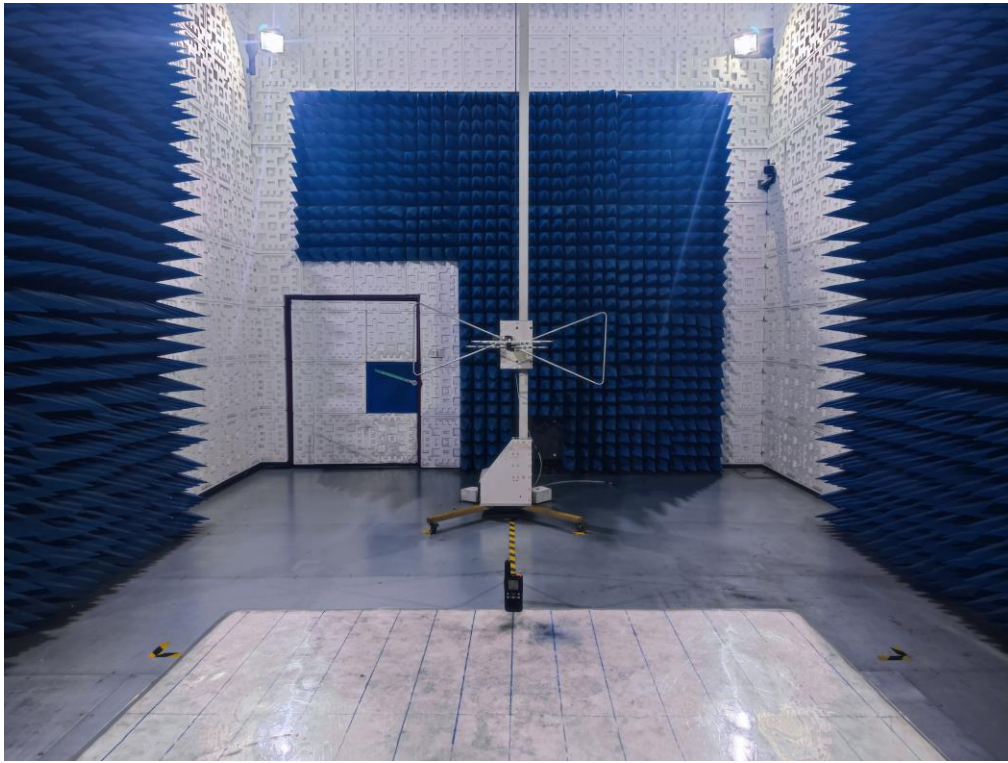
RADIATED EMISSION TEST SETUP ABOVE 1GHz