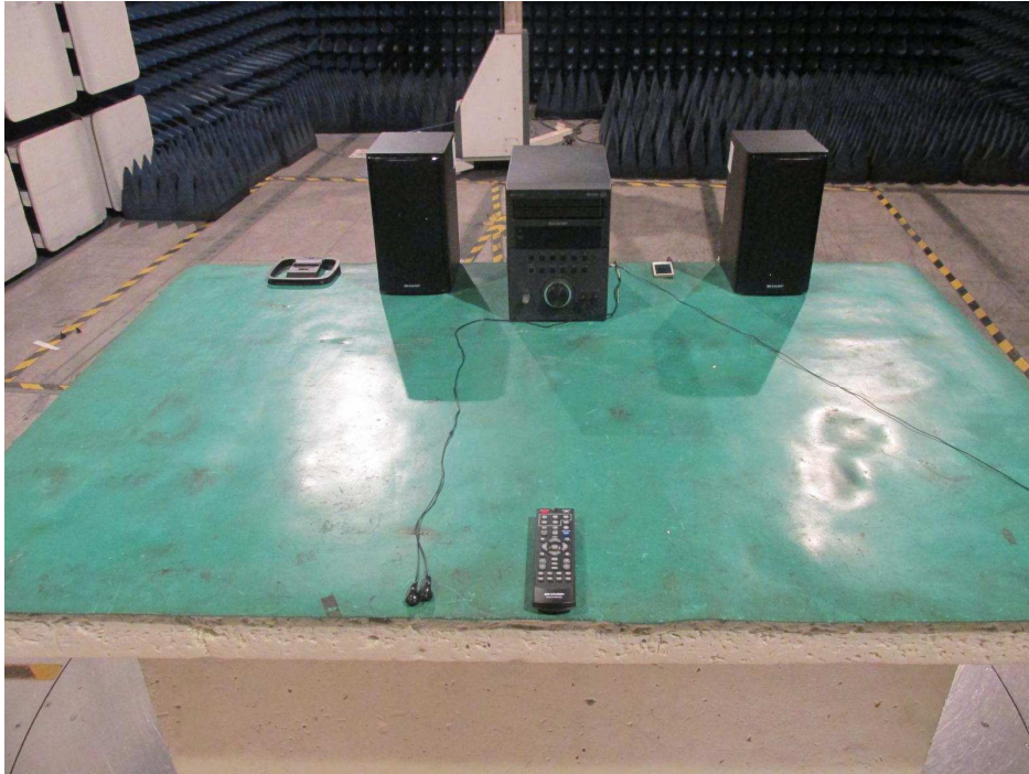
Back View up to 1GHz