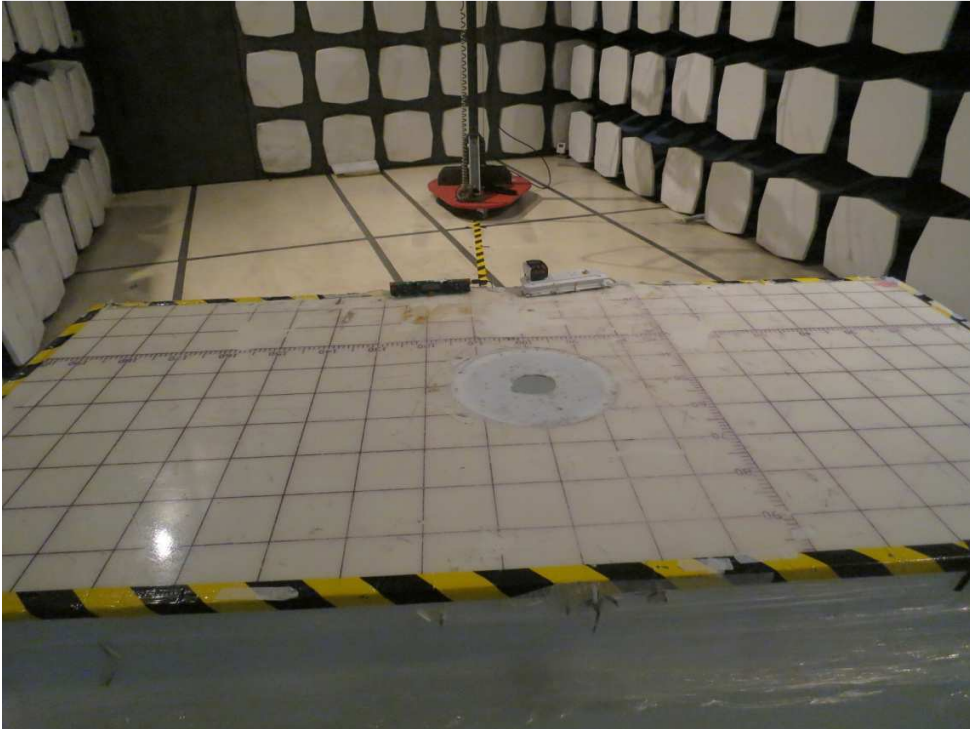
Front View of Radiated Emissions up to 1GHz