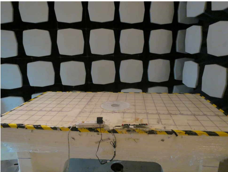
Back View of Radiated Emissions up to 1GHz