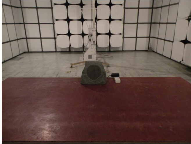
Photos of Radiated emission