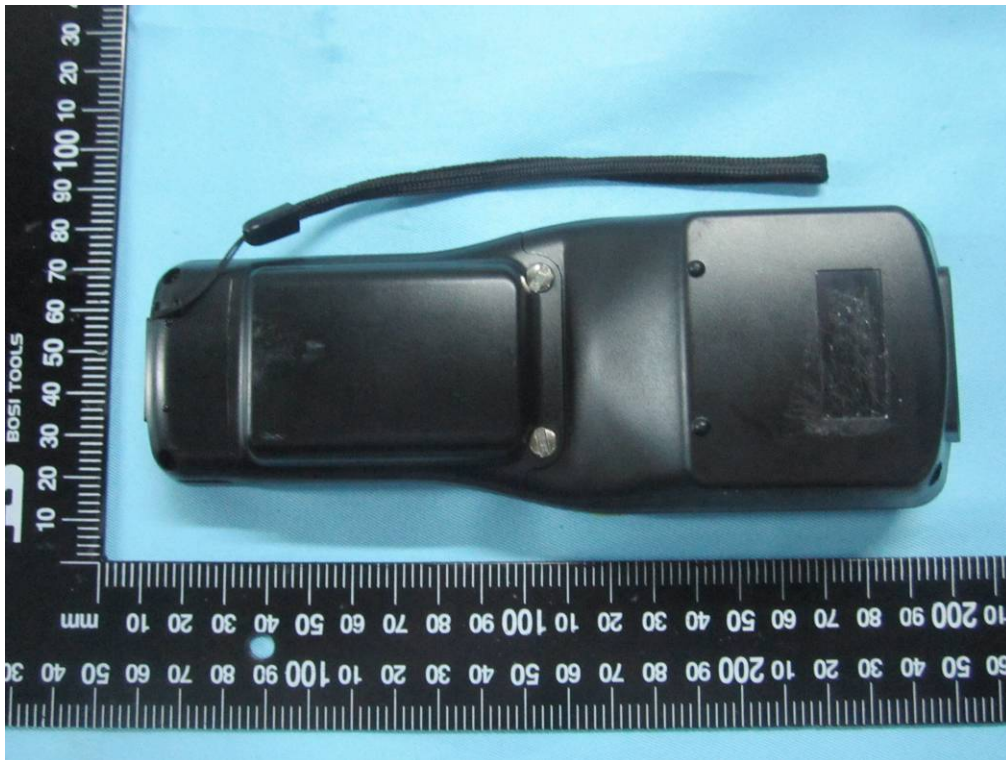
EUT - Rear View