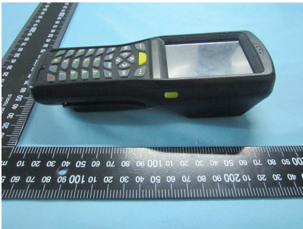
EUT – Right View