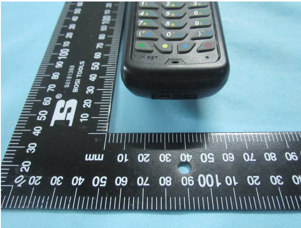
EUT - Bottom View