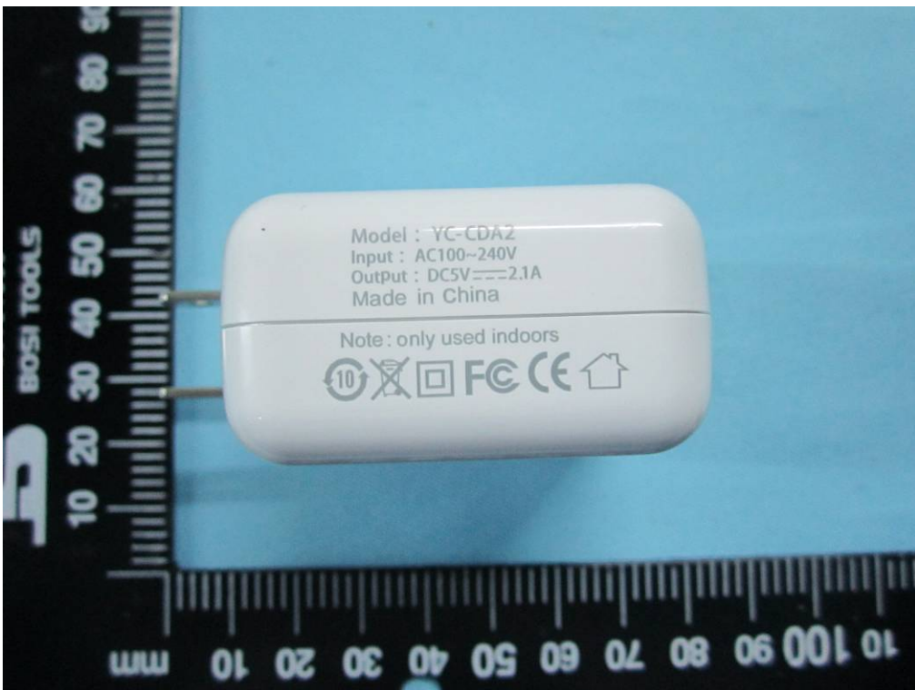
Adapter – Front View