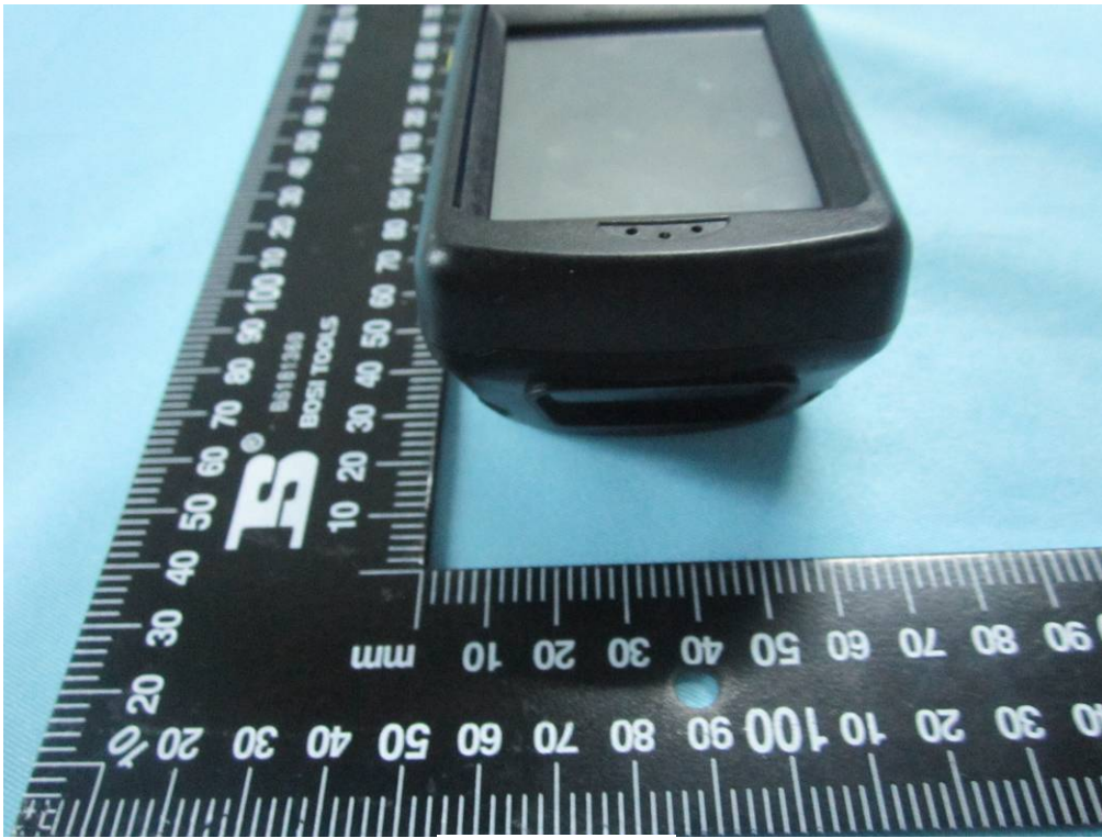
EUT - Top View