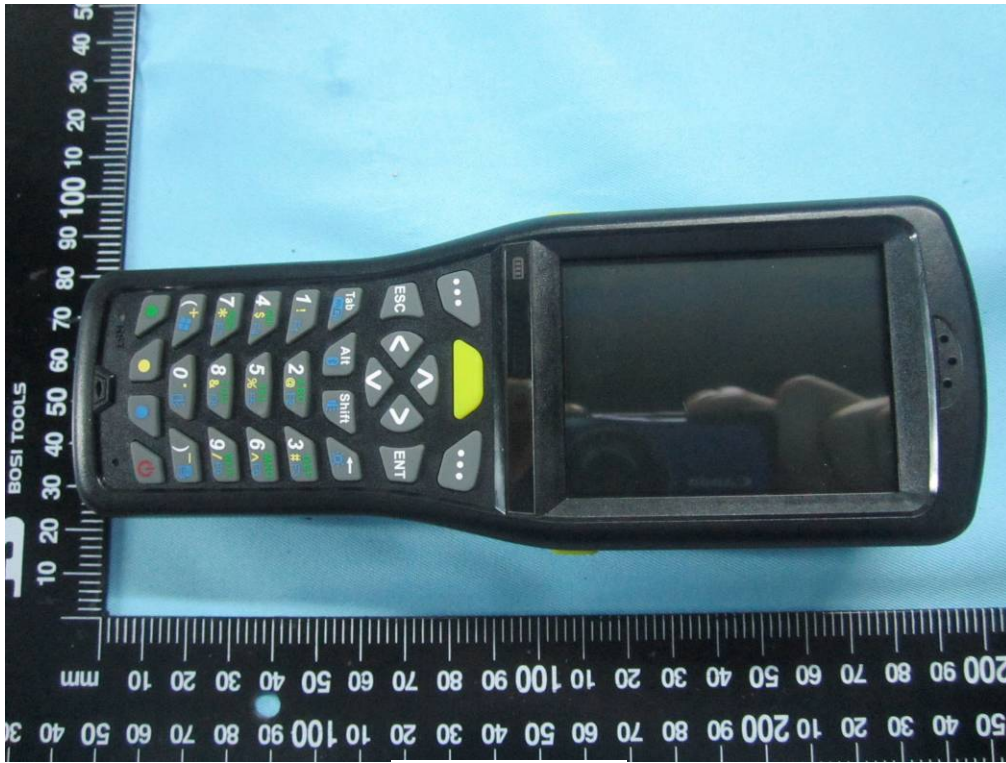
EUT - Front View