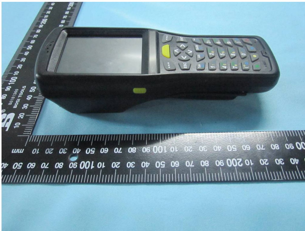
EUT - Left View