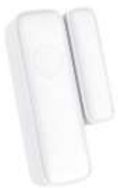
Door Window sensor