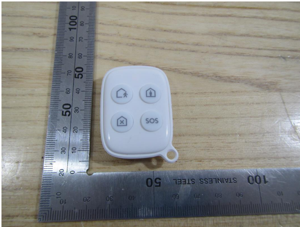
Detail View of EUT