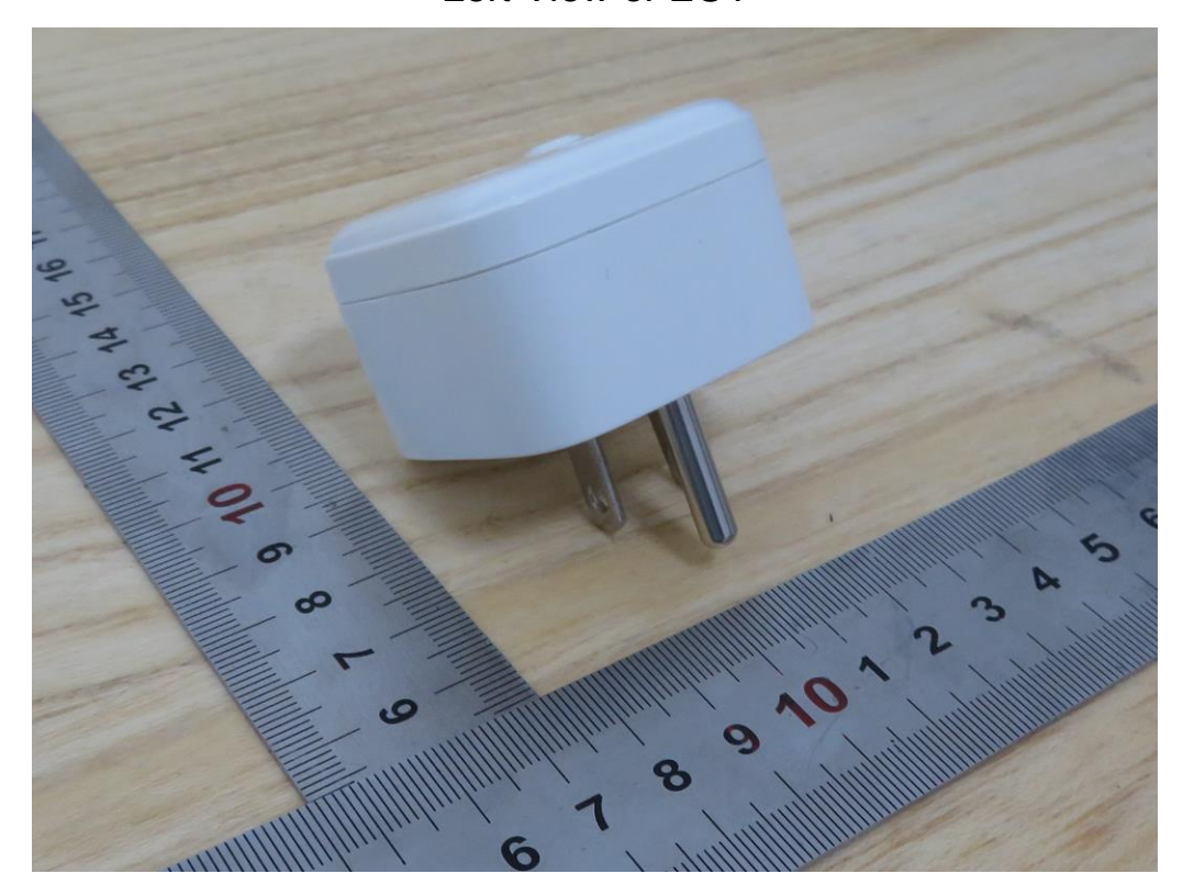
Right View of EUT