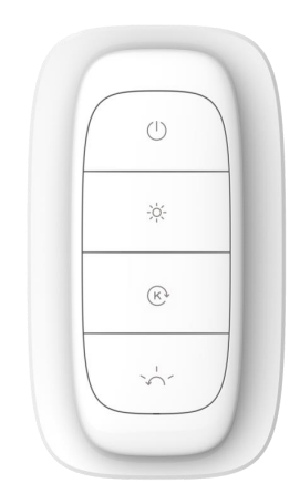
4-key Remote Controller