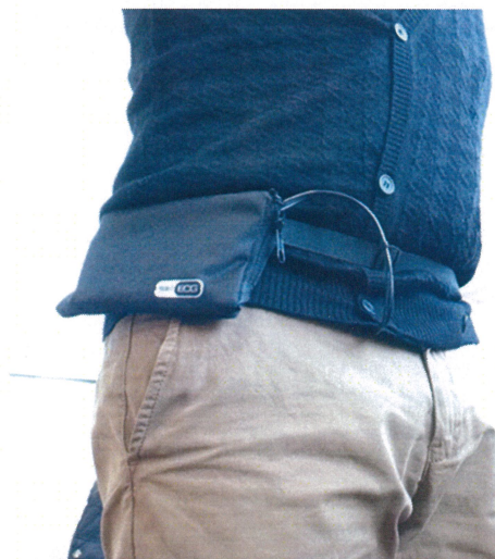
Fig. 1 PocketECG III pouch normal operation

Please see enclosed photos from 1 to 5 that shows pouch intended use and 10 mm spacer location.