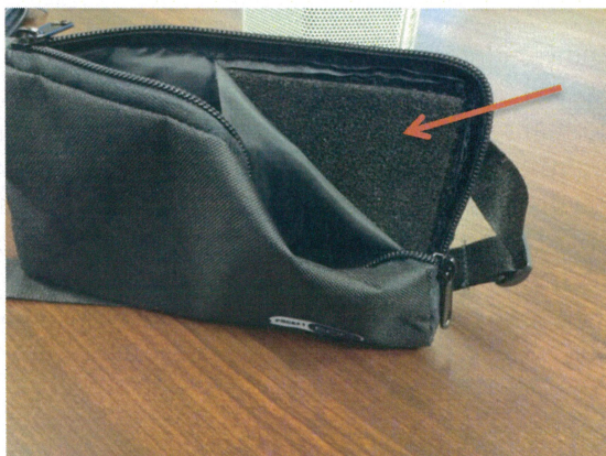
Fig. 5 Internal view of 10 mm spacer location