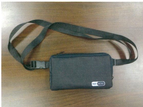
Fig. 2 Front view of PocketECG III pouch