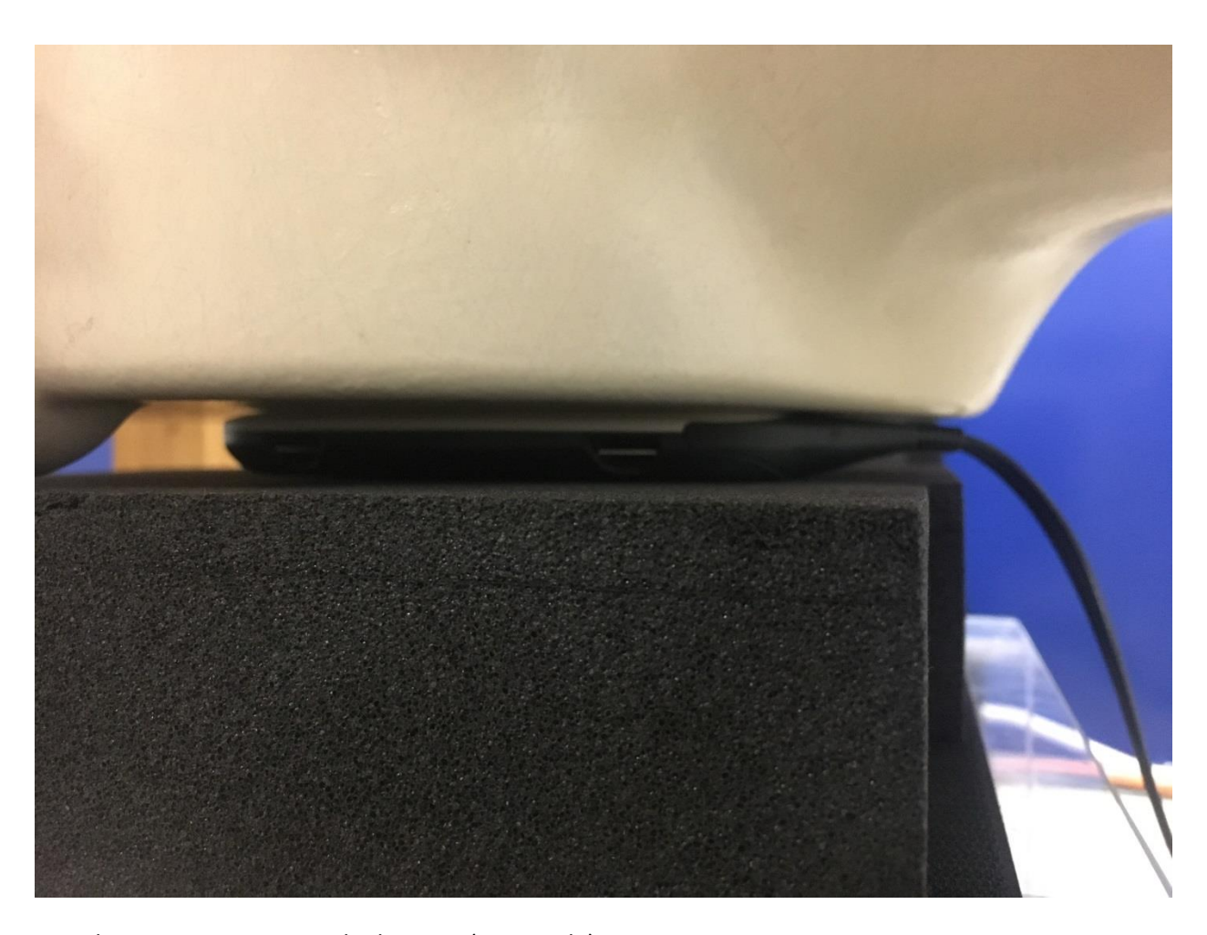
Sample in Direct Contact with Phantom (Front Side)