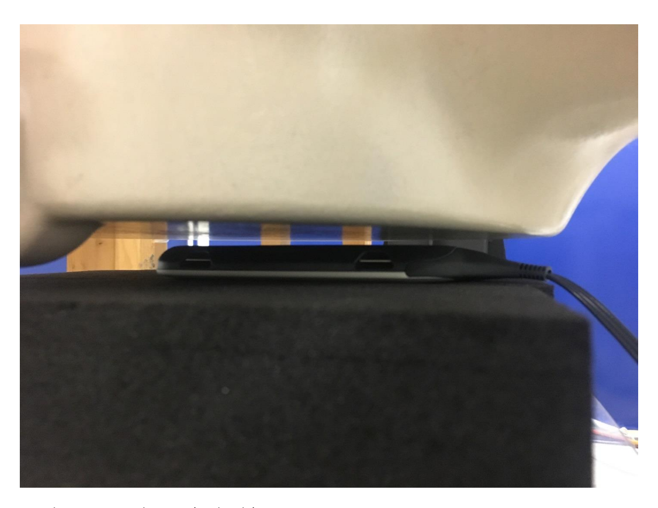
Sample 5mm From Phantom (Back Side)