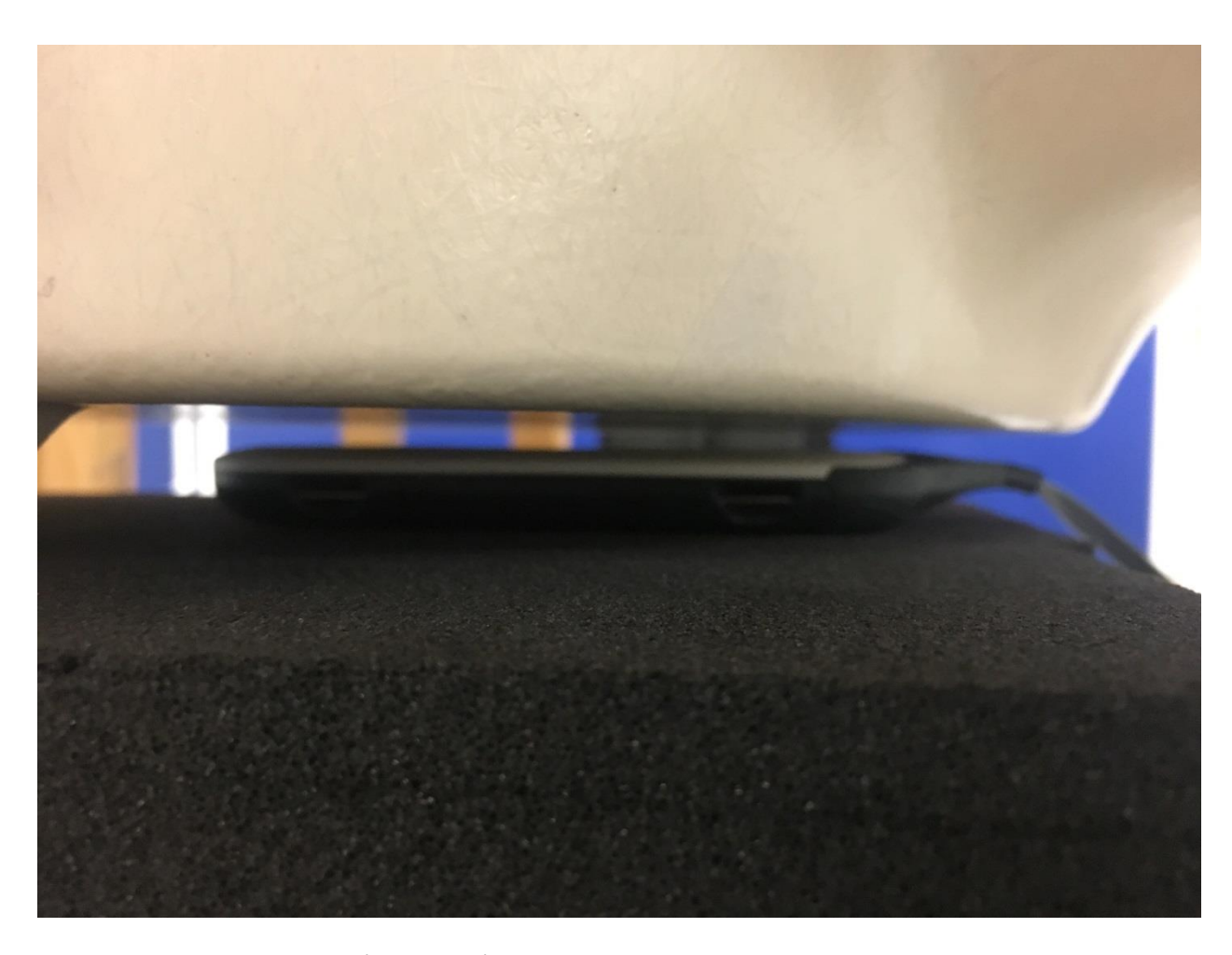
Sample 5mm From Phantom (Front Side)