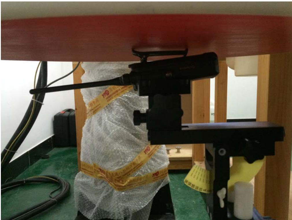
Body-worn, the front of the EUT towards ground with A1, B2, BC2 and C1 (The distance was 0mm)