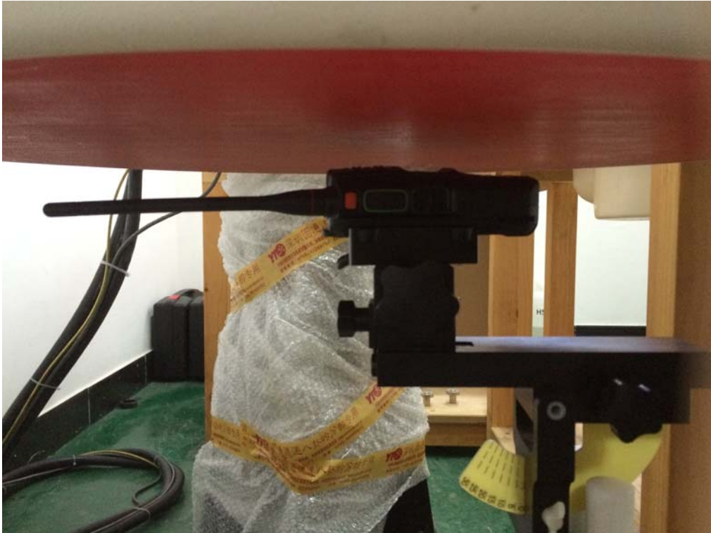
Face-held, the front of the EUT towards phantom (The distance was 25mm)