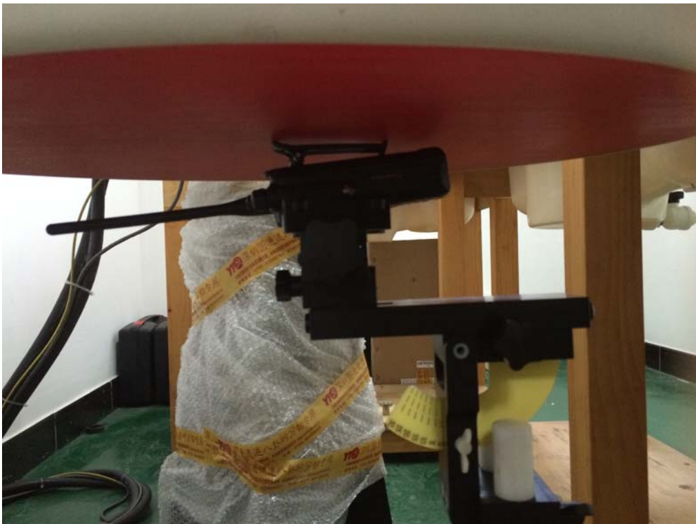
Body-worn, the front of the EUT towards ground with A1, B2, BC2 and C1 (The distance was 0mm)