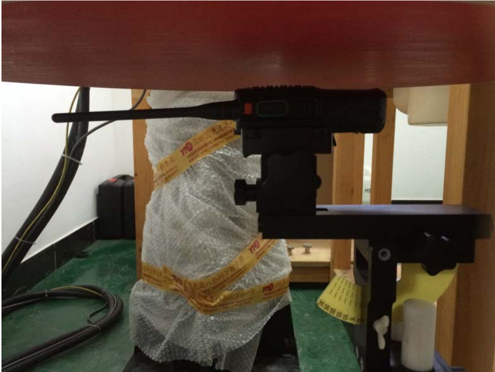
Face-held, the front of the EUT towards phantom (The distance was 25mm)