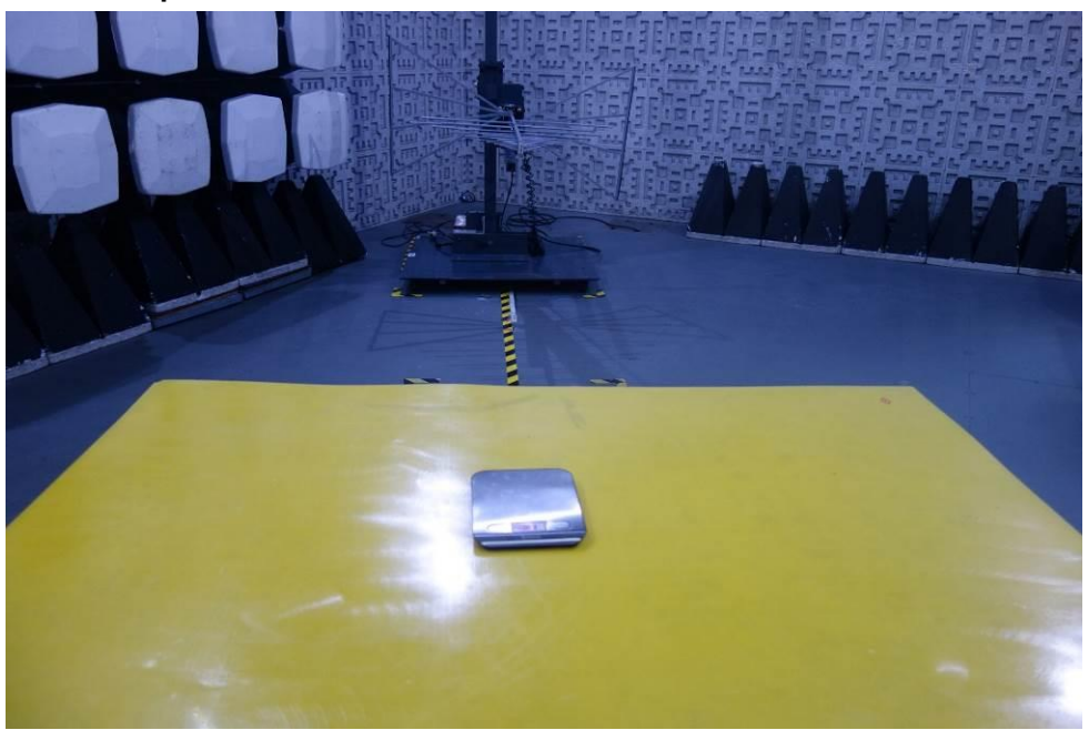
Radiated Spurious Emissions Above 1GHz