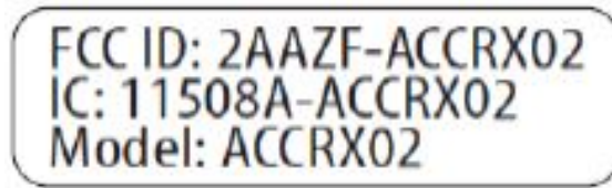
Figure 1. Module label content

Instructions to the end user regarding the labeling requirements for host devices are included in this application.