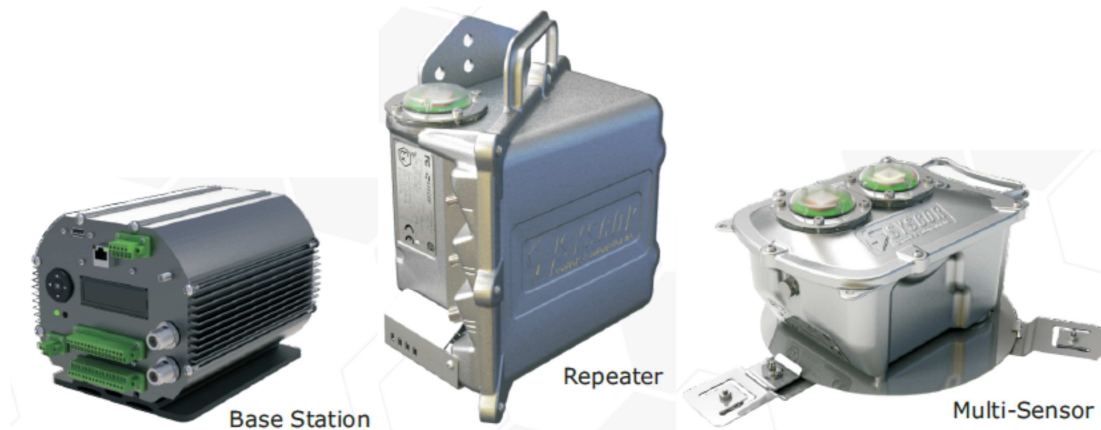
Figure 1: The three devices in the FR tracker system.

The FR-Tracker™ monitoring system consists of Multi-Sensors, Repeaters, and a Base Station. To minimize installation and maintenance costs, the Multi-Sensors and Repeaters are battery-operated wireless devices with battery life expectancy exceeding 10 years. The three devices are shown in Figure 1, and how they interact with each other is shown in Figure 2.