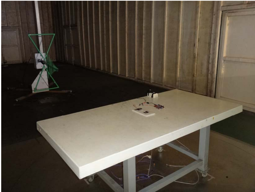
Back View of Radiated Test