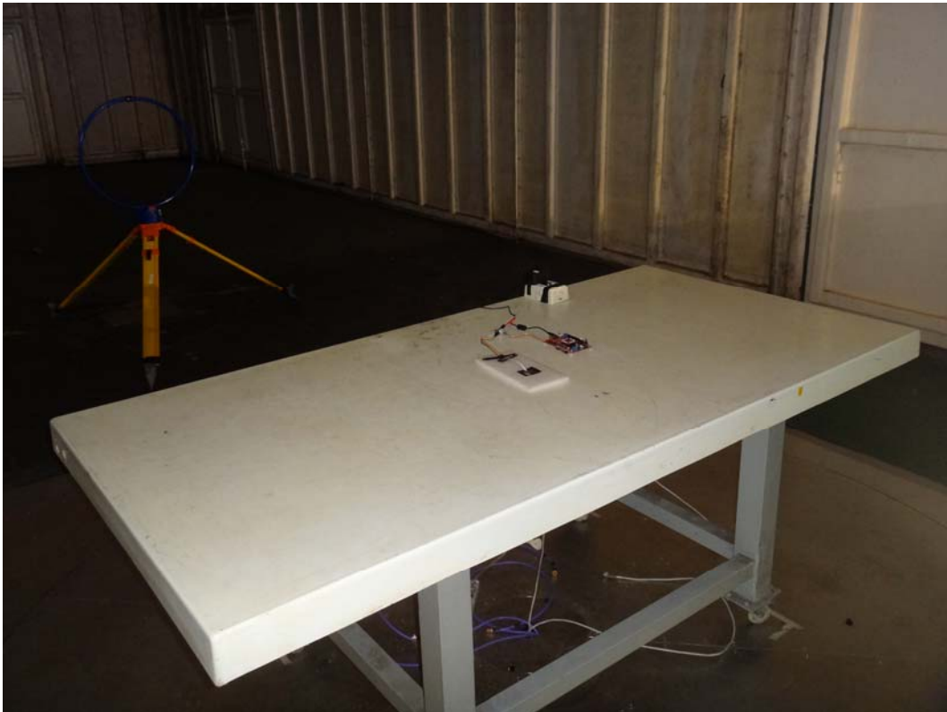
Back View of Radiated Test