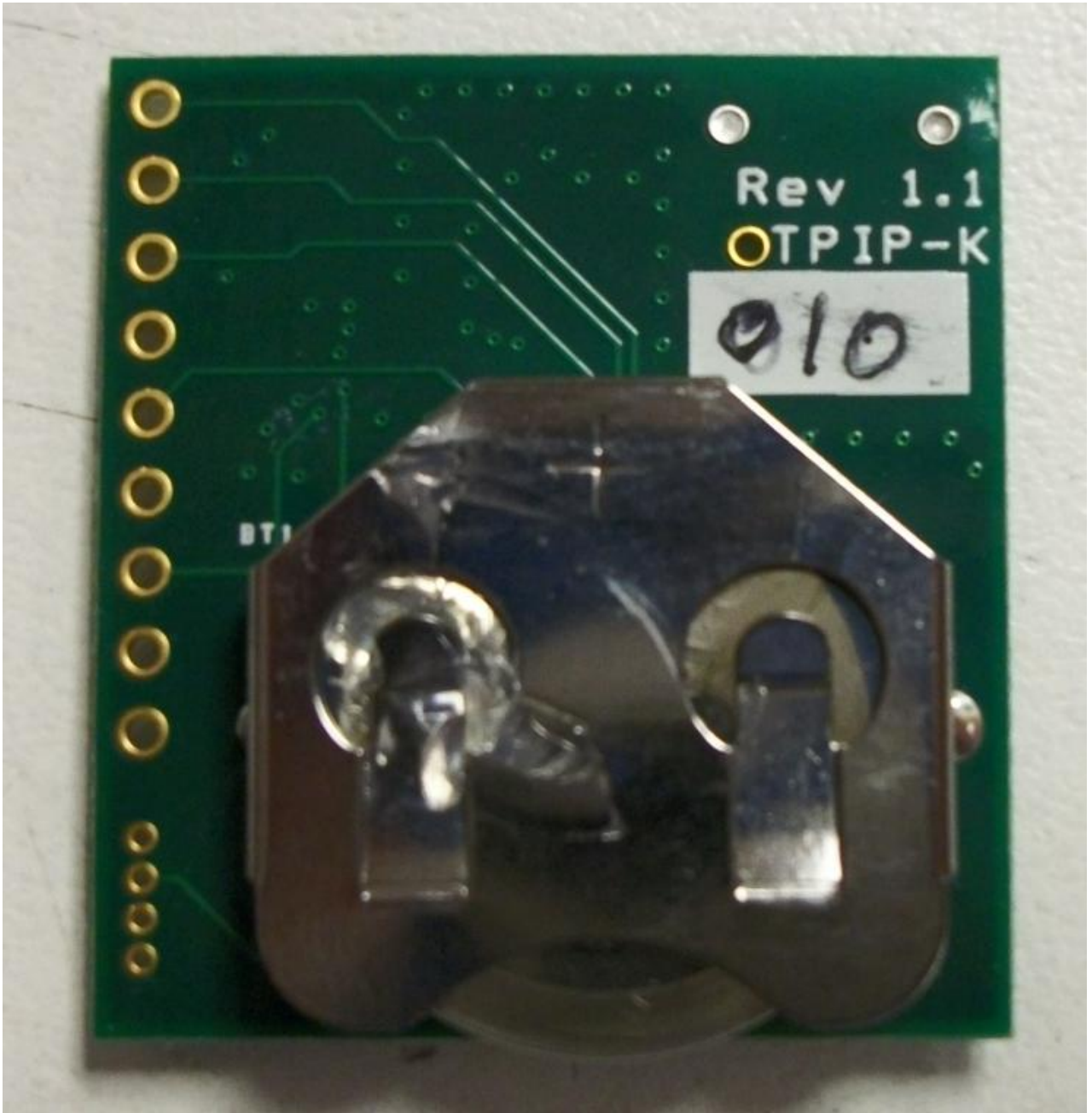
6.5 PCB Foil Side View