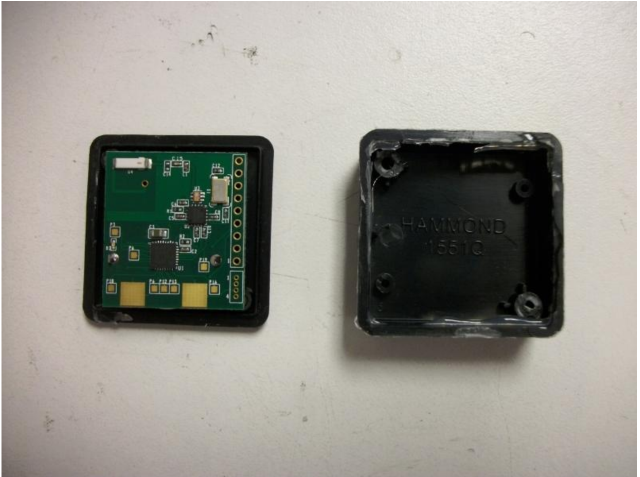
6.3 Inside View