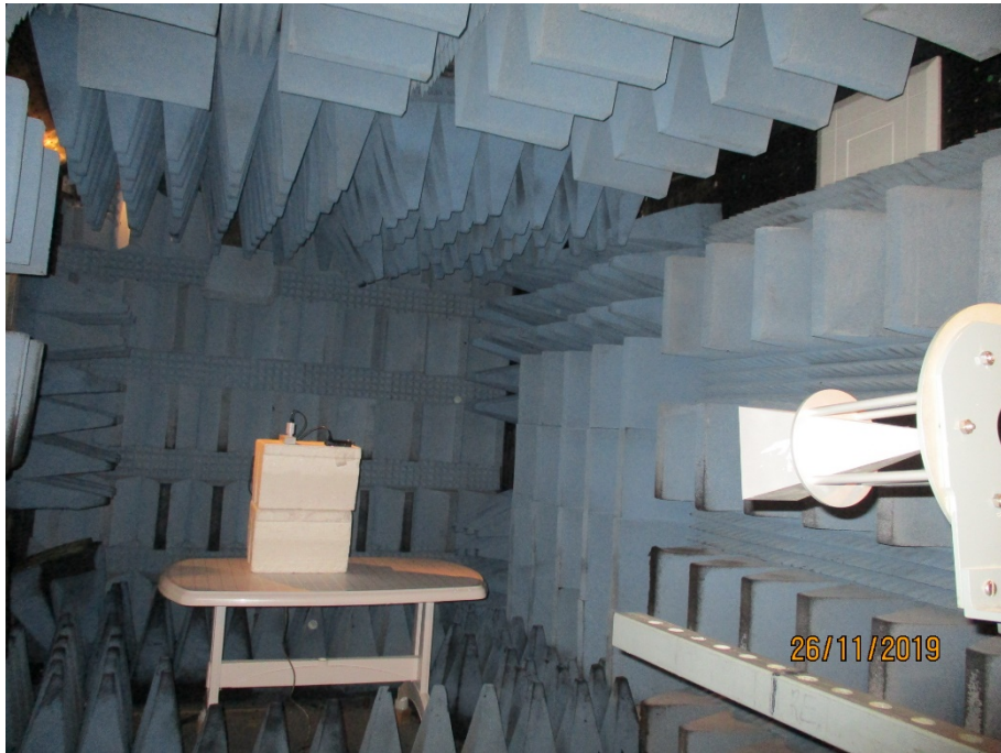
Figure 5. Radiated Emission Test, 18-25GHz