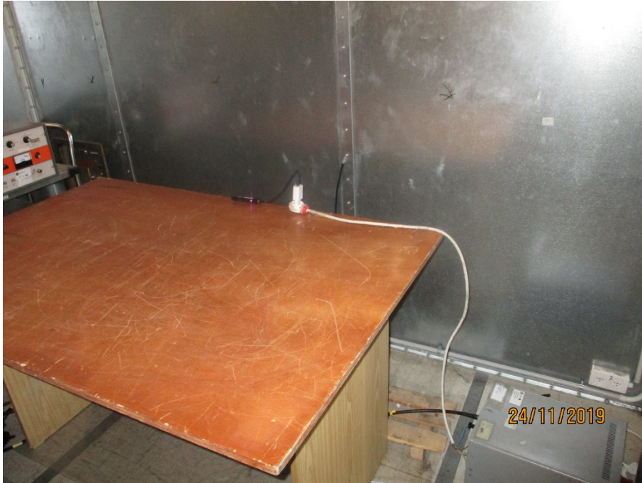
Conducted Emission from AC line Test