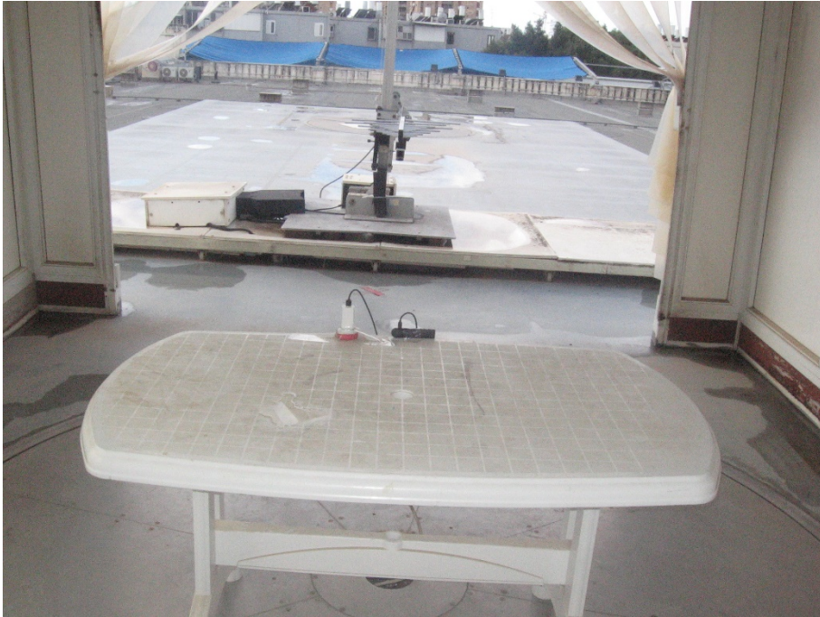
Figure 3. Radiated Emission Test, 200-1000MHz