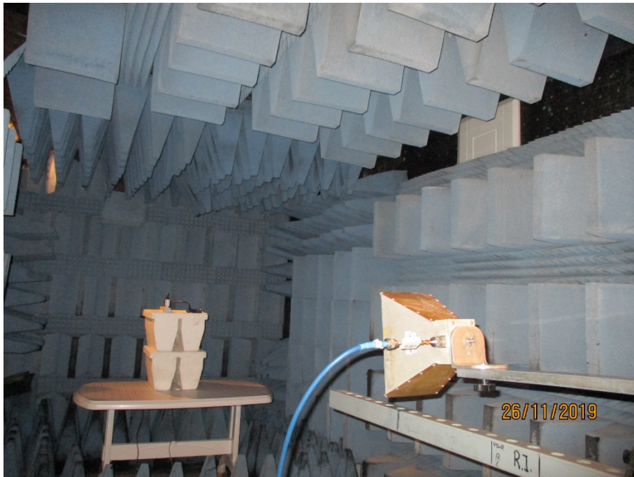
Figure 4. Radiated Emission Test, 1-18GHz