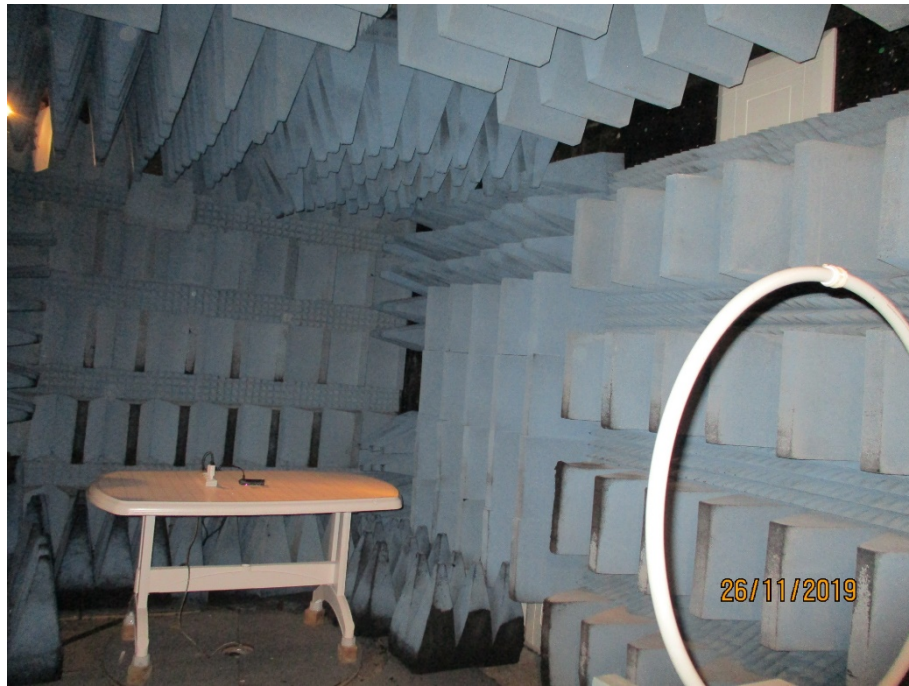
Figure 1. Radiated Emission Test, 0.009-30MHz