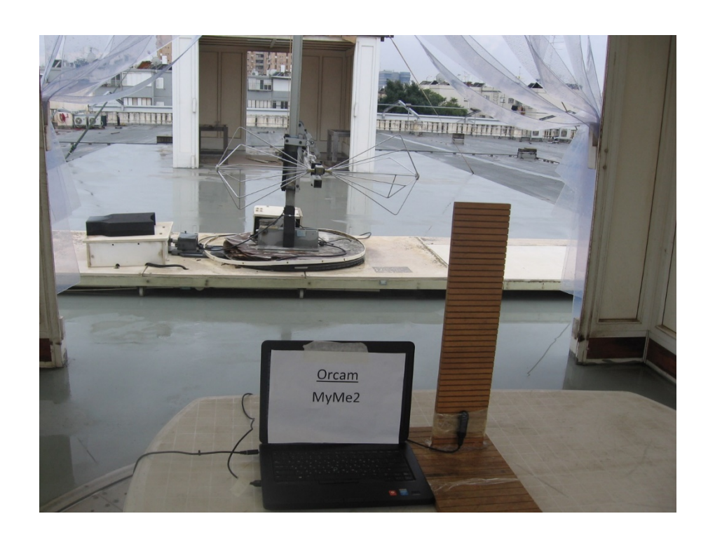
Radiated Emission Test