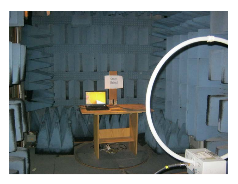
Radiated Emission Test