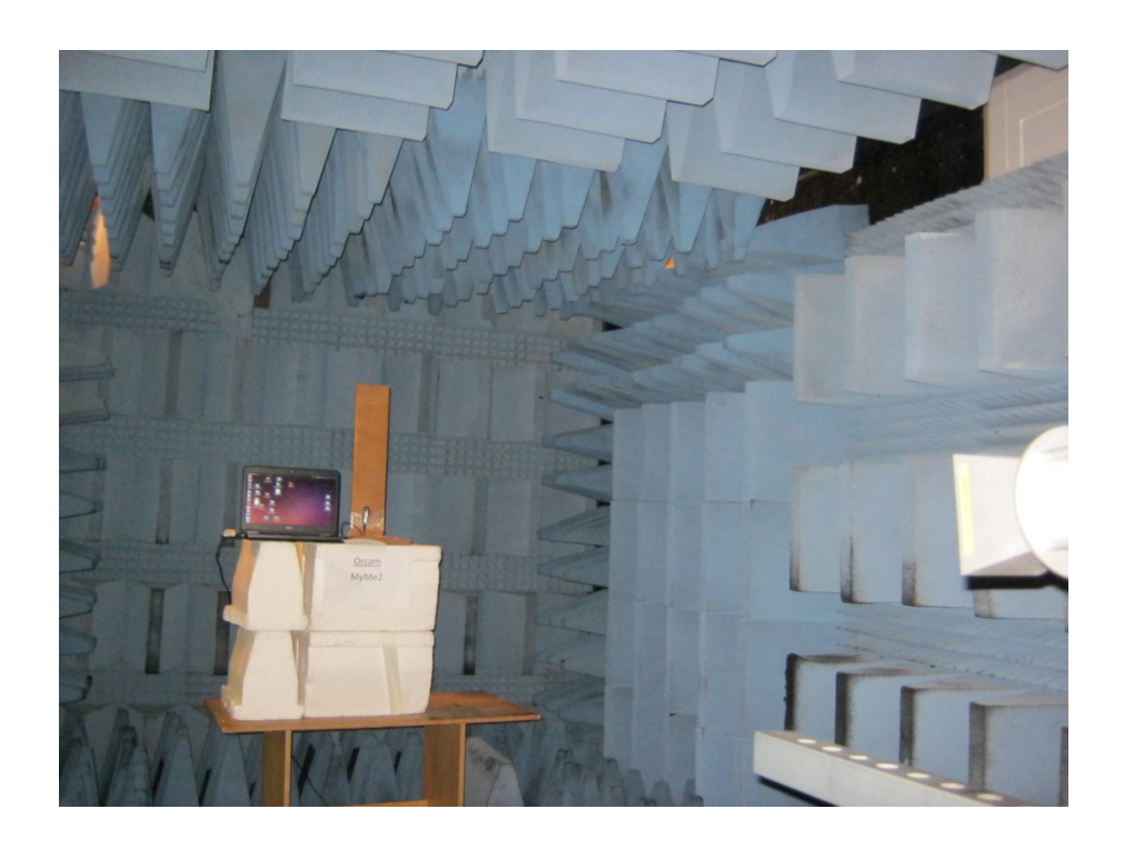
Radiated Emission Test