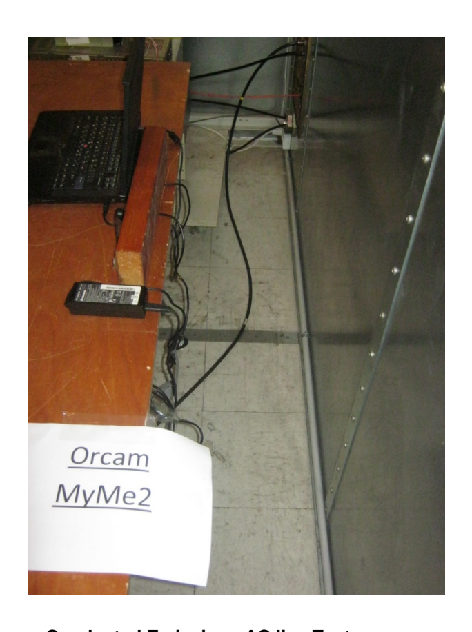
Conducted Emissions AC line Test