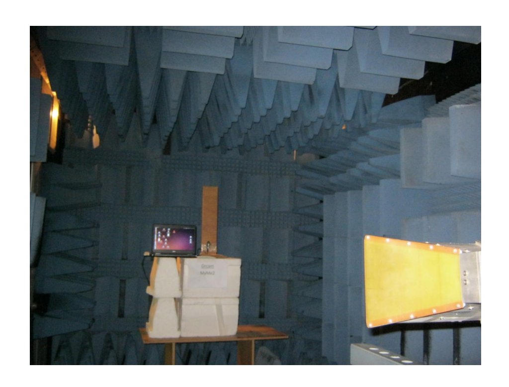
Radiated Emission Test