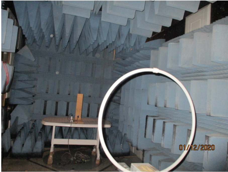
Radiated Emission Test, 0.009-30MHz