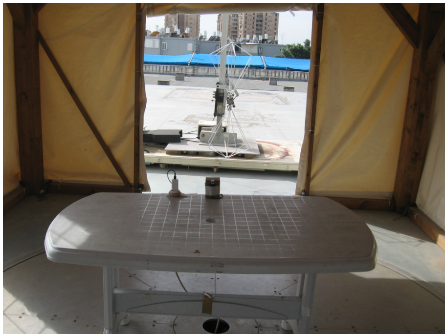
Radiated Emission Test, 30-200MHz