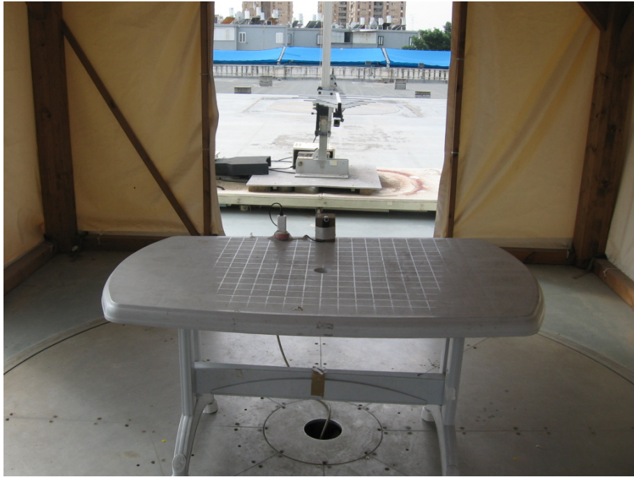
Radiated Emission Test, 200-1000MHz