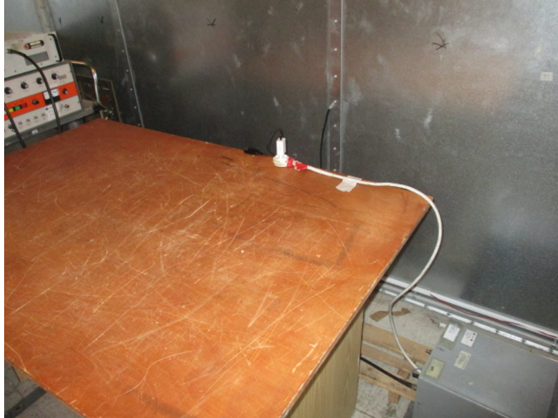
Conducted Emission from AC line Test