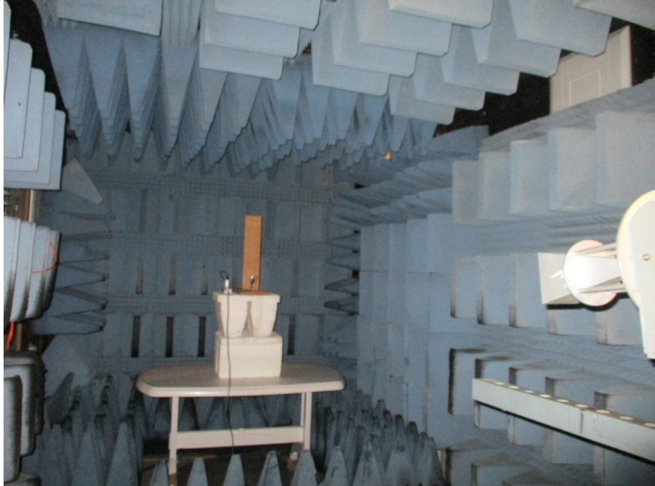
Radiated Emission Test, 18-25GHz